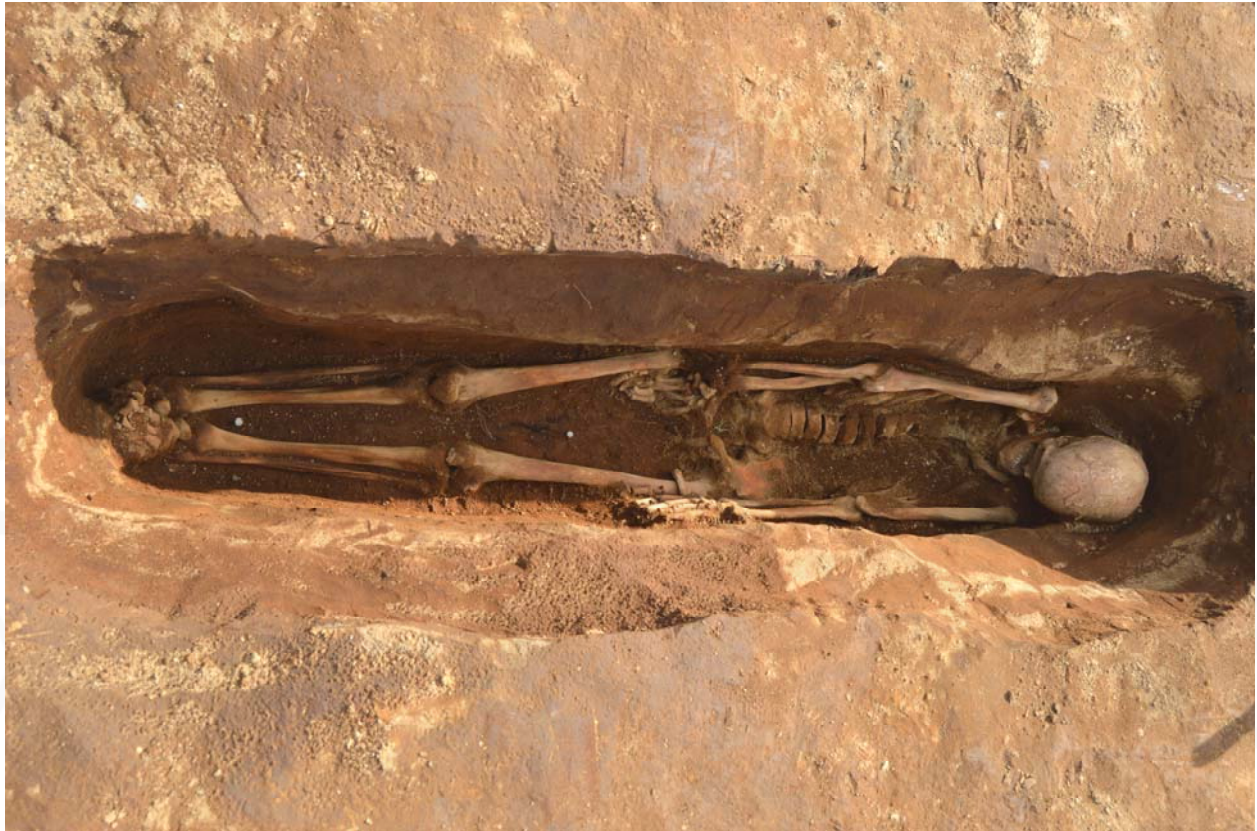
Figure 6. Skeleton HSM-A-128, grave cut [5311].

coffin outline, and staining of the base. The coffin was rectangular in shape with a preserved dimension of 15 x 45 cm and no evidence of a lid. Cut [5311] truncated the north-west corner of the coffin, and disturbed the cranium as well as the left arms and ribs of the skeleton.