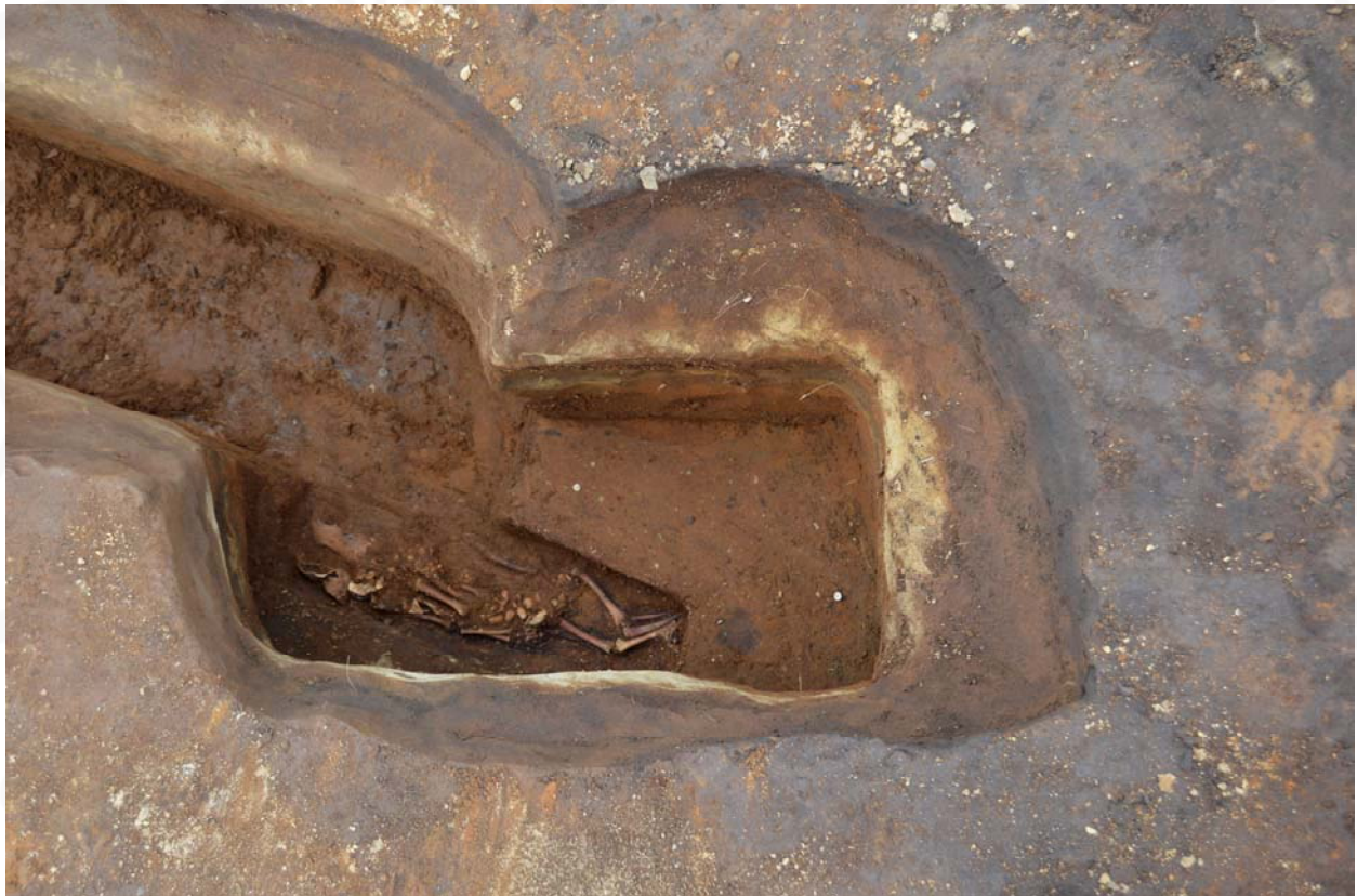
Figure 7. Skeleton HSM-A-131, grave cut [5327]. The truncation of the burial by grave cut [5311] can be seen in the top left hand corner of the photograph

of a lid. Cut [5311] did not truncated the skeleton or the coffin. Immediately south of grave [5323], and truncated by it and grave [5311], was grave cut [5335]. The north-eastern corner had been truncated by [5323] and the western end by [5311]. The surviving dimensions were 0.3 x 0.7 m, 0.4 deep. It contained a mixed silts fill [5334] and skeleton HSM-A-133. This was a well preserved neonatal skeleton, laid out with straight arms and legs with the hands resting next to the pelvis. It had been placed in a coffin, which was visible only as wood stains. The coffin was rectangular in shape, with a surviving dimension of 14 x 45 cm. Slight soil staining on top of the skeleton indicates that the coffin may have had a lid.