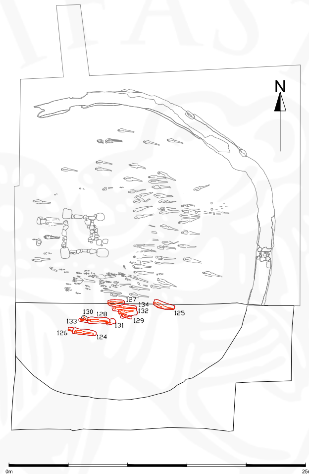
Figure 9. The main archaeological features in the pre-1300 phase. The skeleton numbers are shown. The earlier excavation area is shown in grey, the current excavation area in black. The inner edge of the cemetery boundary is shown.

no evidence that this coffin had a lid. Although the grave was heavily truncated by later burials, this has not affected the skeleton or coffin.