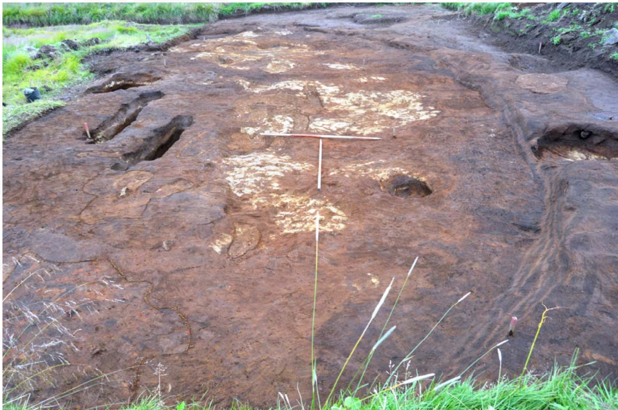
Figure 10. The site at the end of the 2014 season, facing east. The cemetery boundary wall can be seen curving around the right hand side of the photograph. Right of that is one excavated cooking pit, and two which remain to be excavated. The excavated burials can be seen in the top left hand corner. The unexcavated burial cuts are seen in the centre left of the photograph. There has been some truncation of the surface into which the burials are cut, in some instances down to the prehistoric H3 tephra, seen in situ in the centre top of the photograph.

The main focus for the 2015 season at Hofstaðir will be to finish excavating the southern area. This will involve the excavation of all the graves in the area, which have been estimated to be between 30-40, as well as the completion of the excavation outside the cemetery, in particular in the southern part of the site, where it is quite likely that at least two unexcavated cooking pits remain.