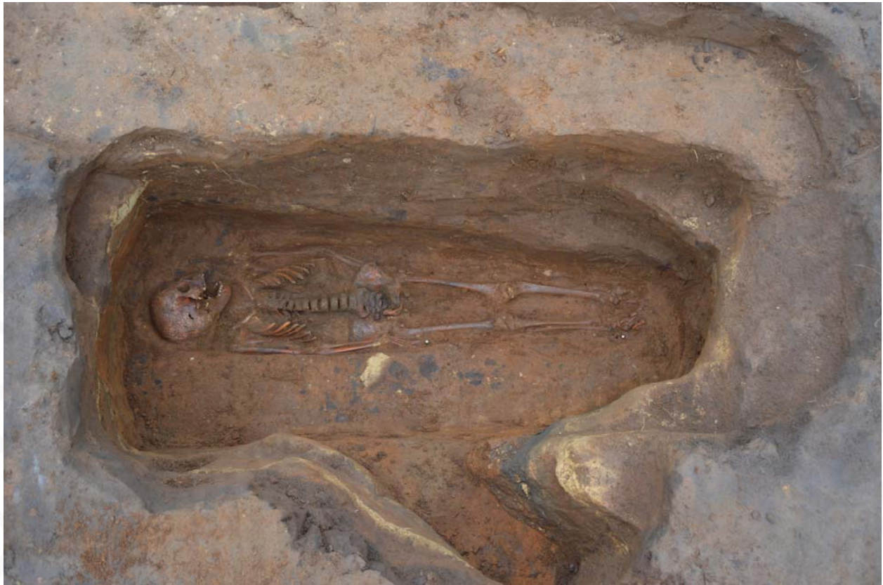
Figure 8. Skeleton HSM-A-132, grave cut [5329] The truncation of the grave by cut [5314] can be seen in the bottom centre of the photograph.

placed within this grave. As the cut [5314] was considerably shallower than cut [5329] it did not truncate skeleton HSM-A-132, or the coffin.