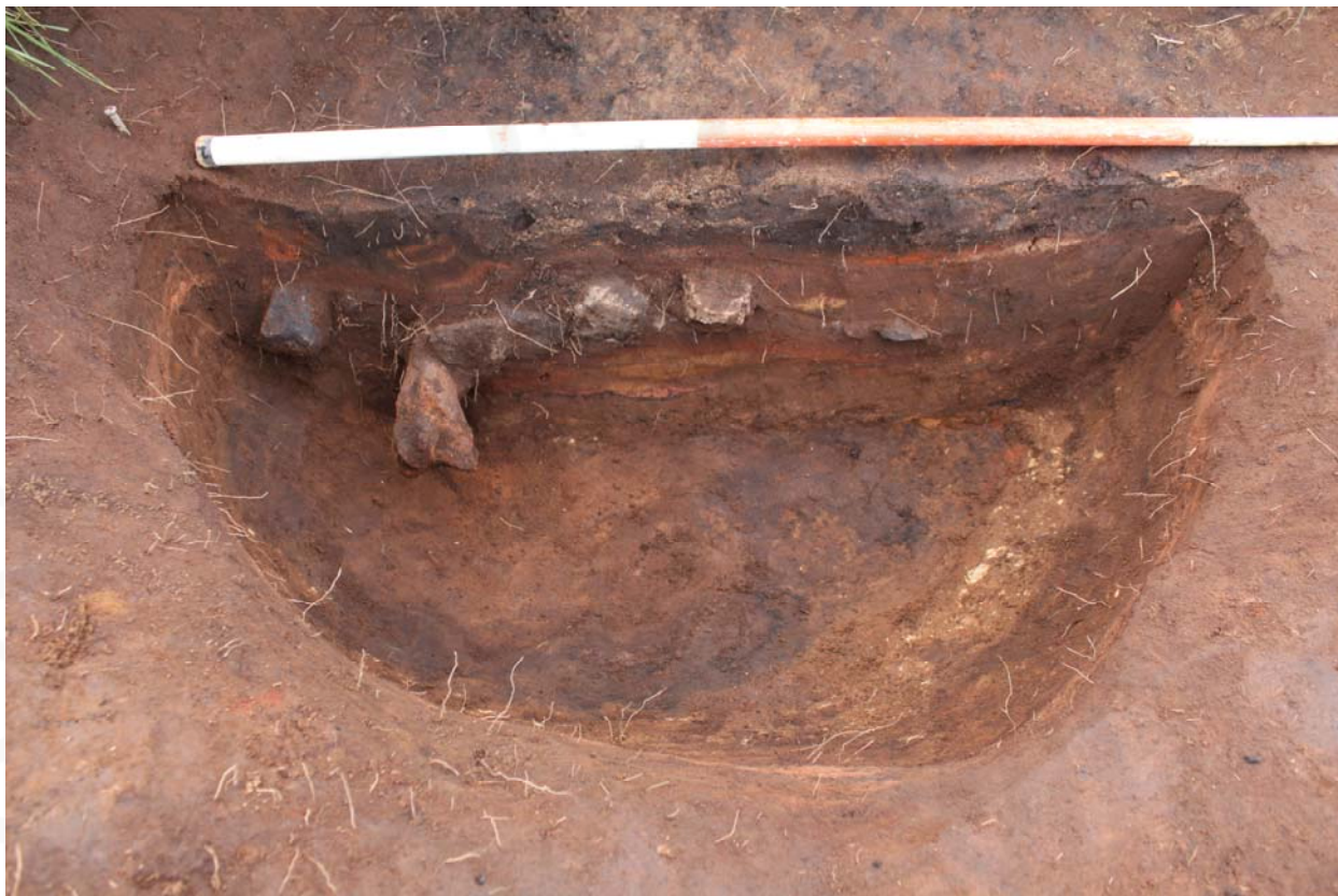
Figure 3. Cooking pit [5306]. Facing west

These cooking pits are all cut into the same surface, formed by a series of units, an aeolian deposit [5293] and two small wood ash/peat ash deposits, [5296] & [5298], which overlie a large aeolian deposit with slight charcoal content, [5309]. They therefore appear to be largely contemporary. Two of the single use hearths also appear to be roughly contemporary to the cooking pits. Cut [5292] was a small sub-circular cut, 0.4 m in diameter (max) and 0.1 m deep, with concave sides and base. It was filled with a deposit of mixed silts with a slight charcoal content [5290], and may be an emptied out hearth. Hearth [5308] was sub-circular, 0.7 m in diameter and 0.2 m deep. The edges are near vertical, the base flat. There was a single fill [5307], charcoal and turf mix, with frequent fire cracked rocks inclusions, in particularly near the upper part of the fill.