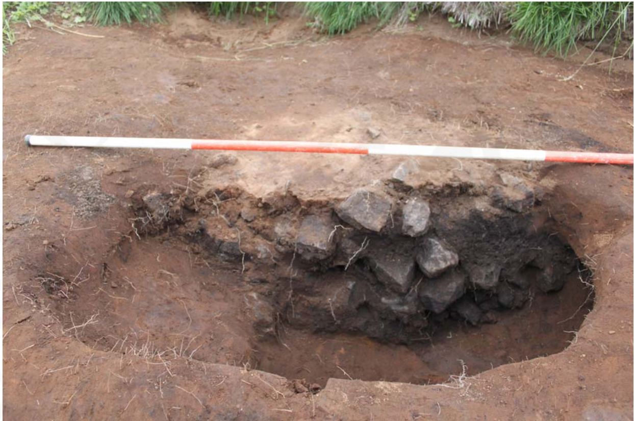
Figure 1. Cooking pit [5284]. Facing west.

flat. The pit contained a single fill [5270] consisting mainly of fire cracked rocks surrounded by silts heavily mixed with charcoal.