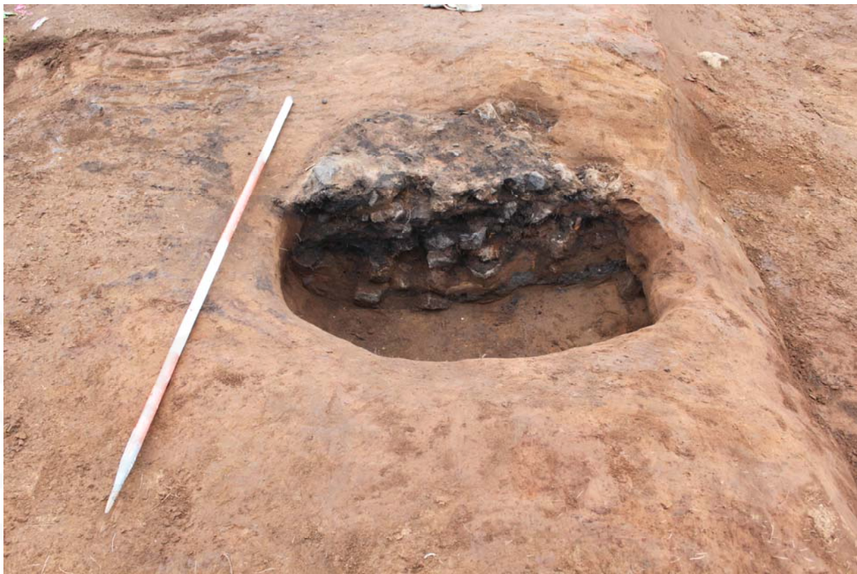
Figure 2. Cooking pit [5286]. Facing west

Cooking pit [5306] was located in the south-western corner of the excavation area, and extended slightly under the western limit of excavation (see figure 3). It was a sub-circular cut, 1.4 m in diameter (max) and 0.3 m deep with gently sloping sides and a concave base. The pit contained five separate fills. The topmost was a charcoal layer [5301], with inclusions of fire cracked stones. This sealed a layer of turf debris [5302], which in turn sealed a thin layer of charcoal in amongst large fire-cracked rocks [5303]. This sealed another layer of turf debris [5304]. The base of the fill was a mixed layer of charcoal and peat ash lenses, with H3 tephra inclusions [5305]. This deposit covered the base of the cut, and lay up against its southern edge.