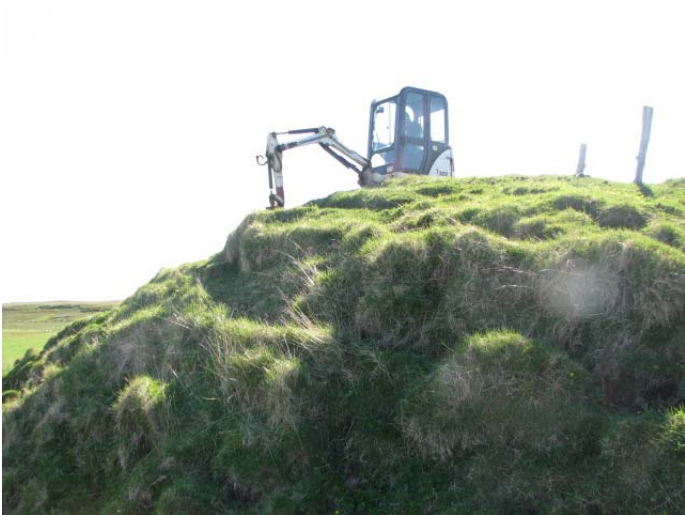
Figure 3: Re-opening of the midden excavation with bobcat