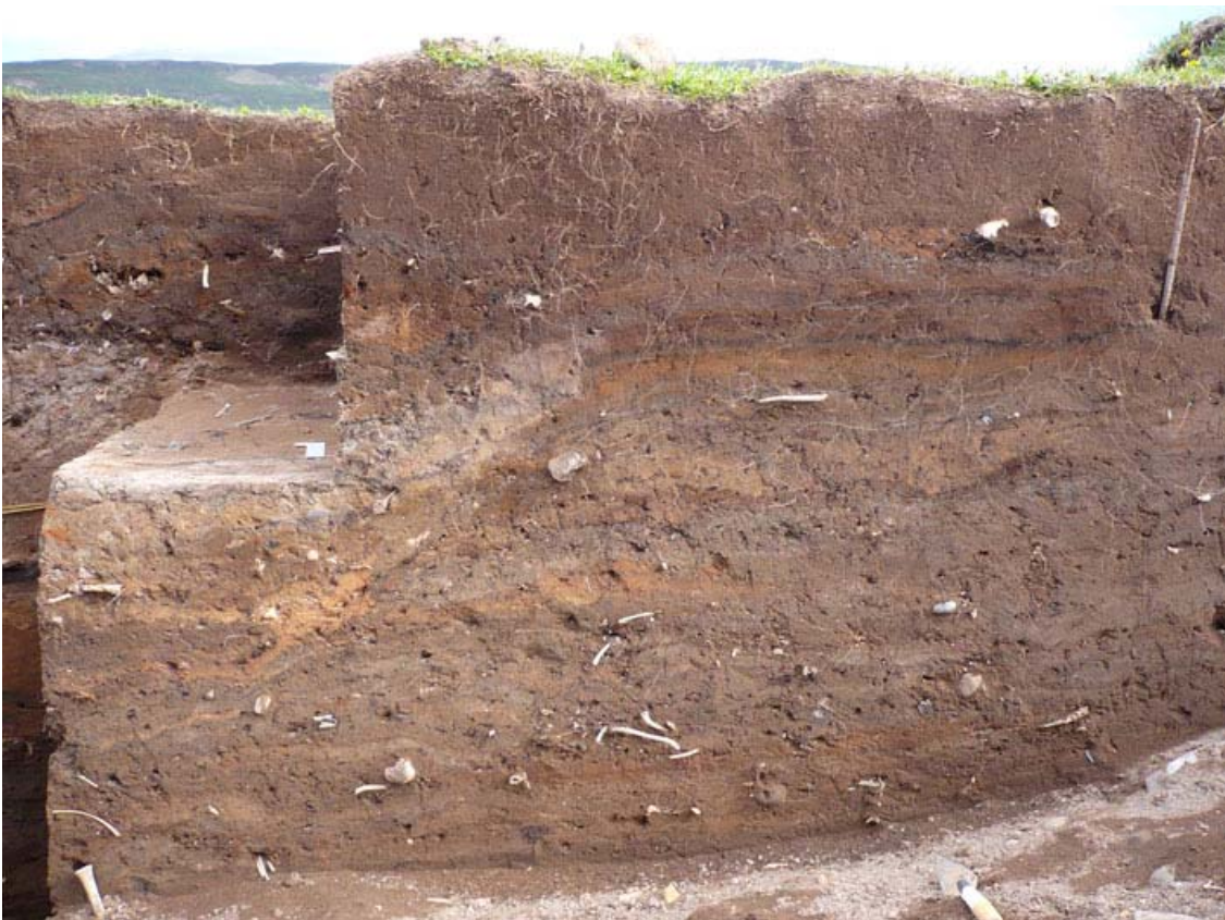
Figure 8: North Section of Main unit squares G20, G21, G22, showing step excavated into the west wall of G20 and erosional cut in upper half of the section.