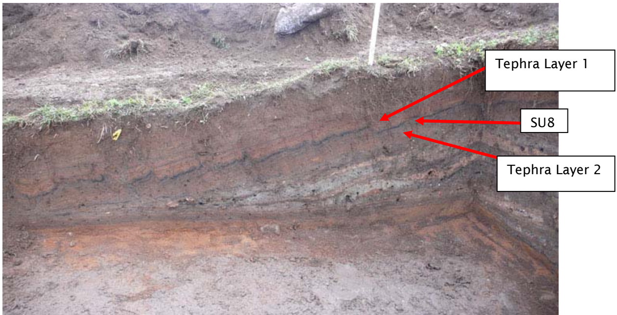
Figure 9: South Section of the Main unit, squares I20 and I21. Note the presence of cryoturbation features in AU8 and surrounding tephras while the basal midden layers are undisturbed