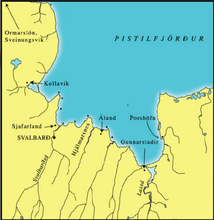
Figure __: Map of the Thistilfjordur region, northeast Iceland.