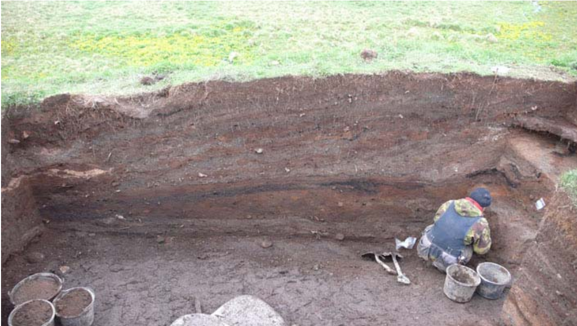
Figure 7: Uggi Aevansson excavating in the Old/Extension unit. SU8 is clearly visible as a thick black band in the middle of the section, with post-medieval ash and turf soil layers deposited on a slant above, and turf and midden layers below.