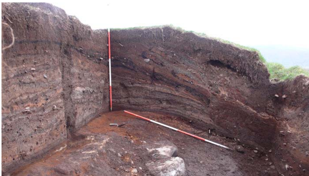
Figure 11: West section (centre) and South section (left) of the Extension unit (H15, H16, G15, H15), showing the sharply defined erosion cut in the midst of the midden deposit, running parallel to the break of slope. Note also the height of the SU 8 in the southern section at left as compared to the north (right)