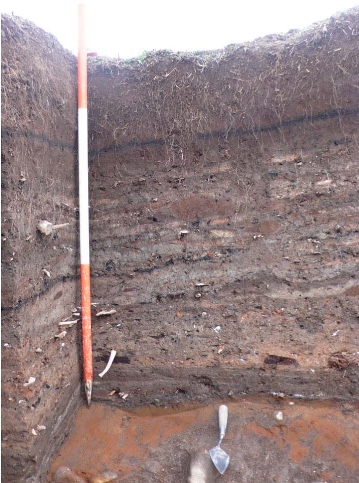
Figure 14: Southeast corner of Extension Unit (Unit H17) showing depth of midden accumulation and sharp contacts of peat ash layers, demarcated by thin lenses of darker organic rich soil horizons.