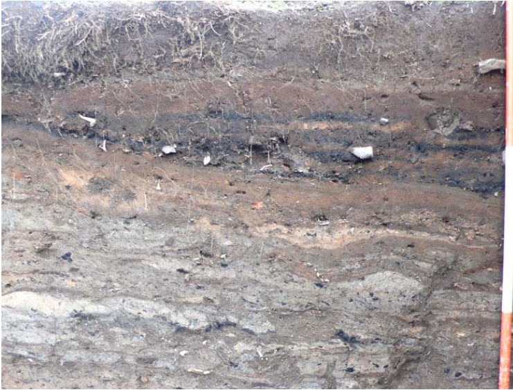
Figure 13: South section of square H15, the south-western corner of the Extension unit, showing the thickness and heterogeneity of SU8, including dense charcoal deposits mixed with red turf ash lenses.