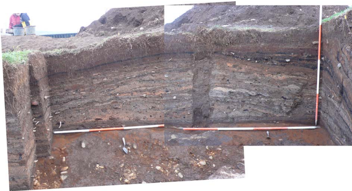
Figure 10: Photo mosaic of south section of Extension unit (H15 to H17) showing SU8 located very high in the section wall, overtop of a thick deposit of ash lenses. The 1988 archaeobotanical sampling column is seen at centre.