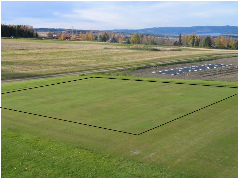
Photo 1. The variety green at Apelsvoll, October 2007.