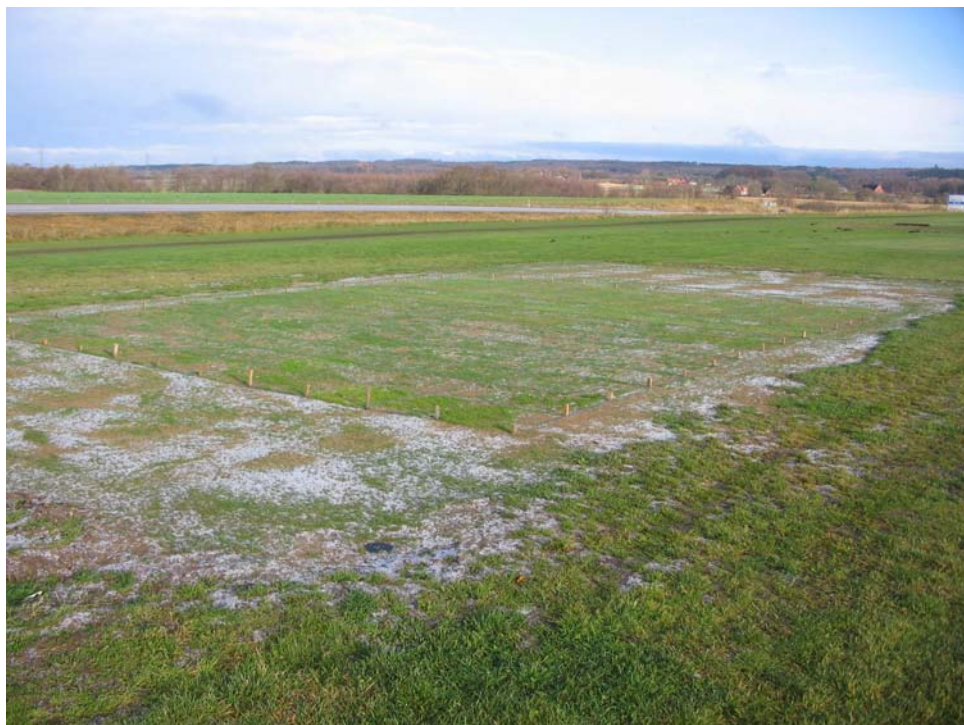
Photo 4. The variety green at Östra Ljungby, October 2007.