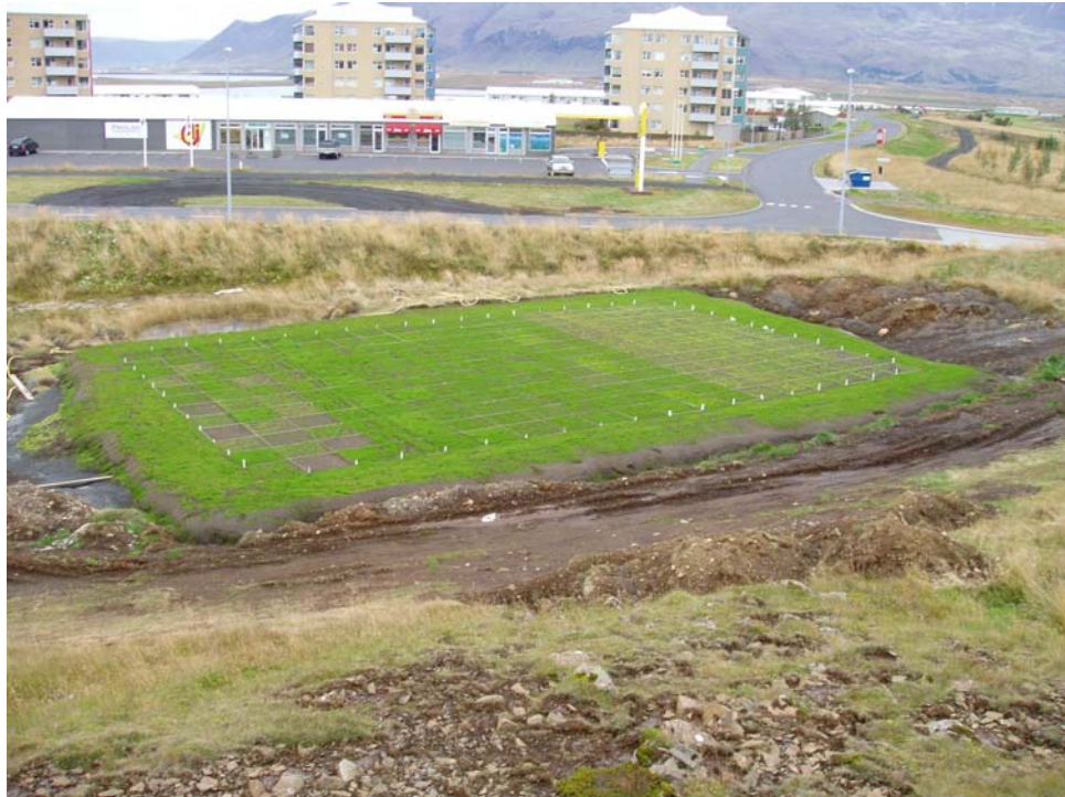
Photo 3. The variety green at Keldnaholt, September 2007.