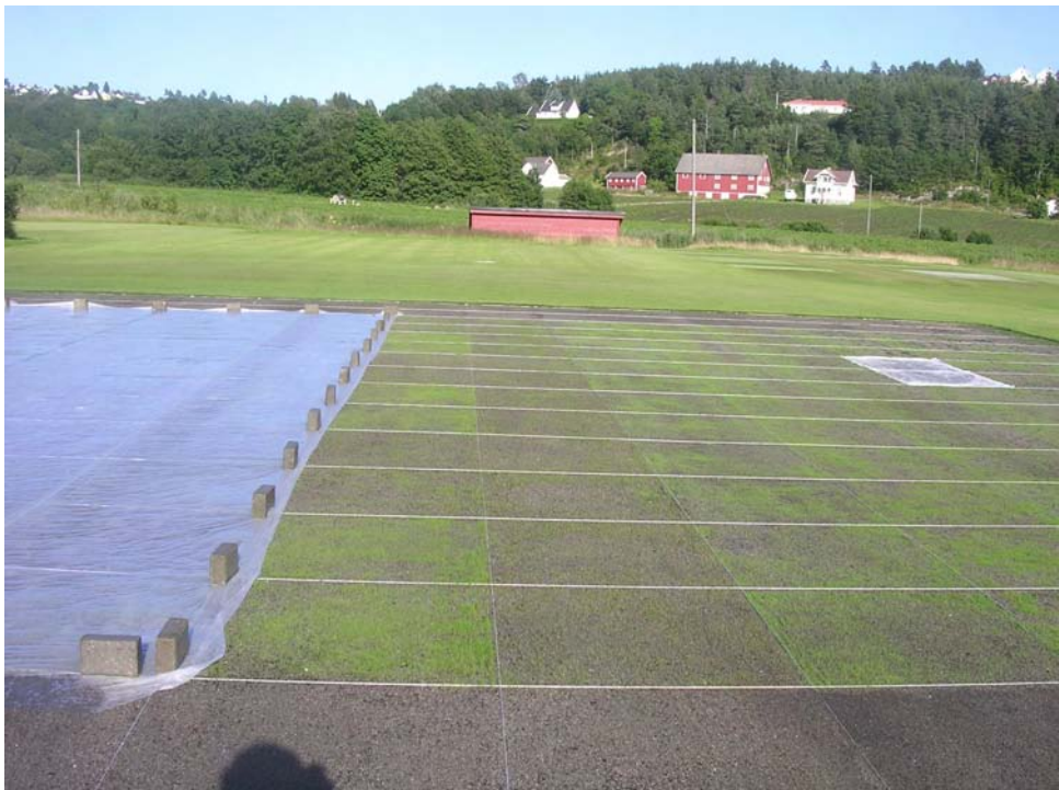
Photo 2. The variety green at Landvik, July 2007.