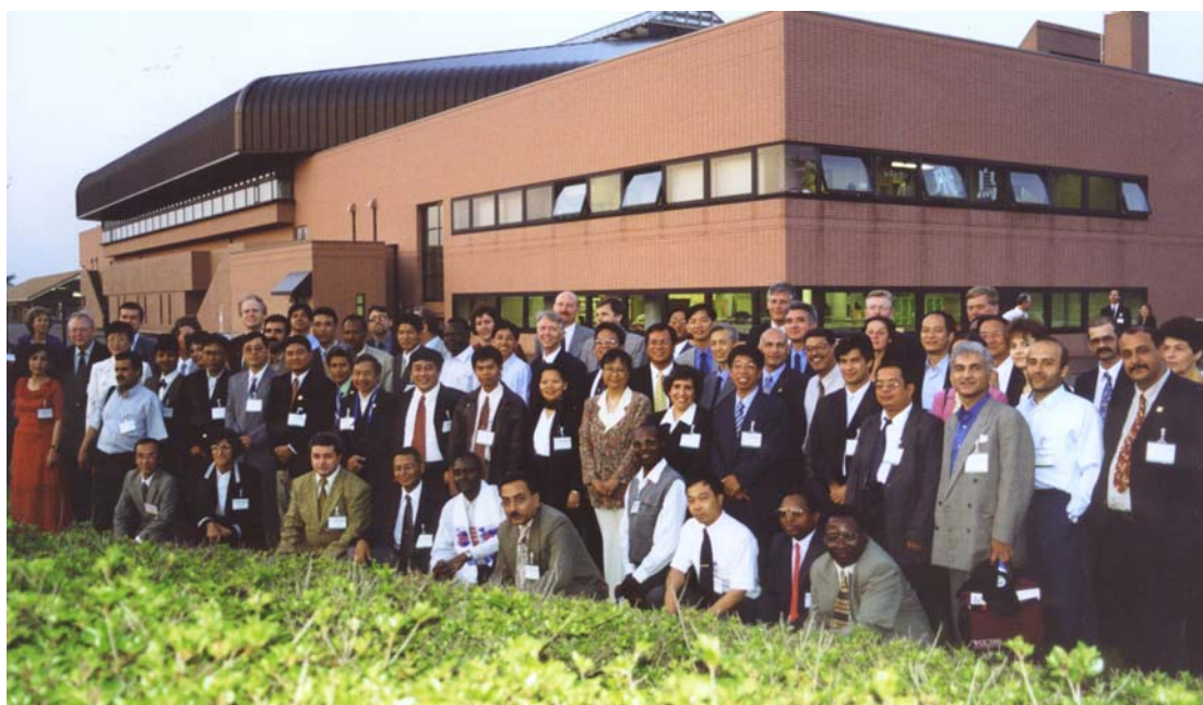
Figure 2: Fellows trained at the UNU Geothermal Training Programme (UNU/GTP) in Iceland during 1979-1999 were authors or co-authors of 85 technical papers at the World Geothermal Congress 2000 in Japan. Out of a total of 227 Fellows who had completed the six month courses in Iceland, 61 from 24 countries attended the Congress and presented papers. The photo shows the Fellows with the UNU Rector, the director, and a few instructors of the UNU/GTP.

A reunion was held for the UNU Fellows, members of the Studies Board and teachers/instructors of the UNU/GTP, as well as for several UNU Visiting Lecturers who have taught at the UNU/GTP through the years (see Figure 2). It was a great occasion where former classmates met who were trained in Iceland as much as twenty years ago, and who presently are among the leaders of geothermal development in their respective countries. A similar reunion was held at the World Geothermal Congress 1995 in Florence (Italy) where 35 former Fellows (out of 161 graduates) attended and presented papers. The next World Geothermal Congress will be held in Turkey in 2005.