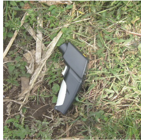
FIGURE 5: An infrared thermometer used for the determination of ground temperatures

Ground temperature distribution in an area is controlled by various factors in the proximity of the heat source to the surface which could be a magma chamber, granitic rock or an intrusive body, depth at which the readings are taken and the kind of formation encountered, consolidated or loosely held and the weather conditions prevailing at the time of measurement. Measured ground temperature determinations are often carried out at a depth of about 0.7 meters. An infrared thermometer or a thermocouple with a probe is often used. Ground temperatures may delineate areas of localized heat sources but could serve as a guide of possible anomalous temperatures in a thermal area especially where ambient conditions are close to room temperatures. The technique can be applied cautiously especially in areas with very hot temperatures e.g. desert environments. Figure 5 shows a thermal infrared thermometer that is used in this technique.