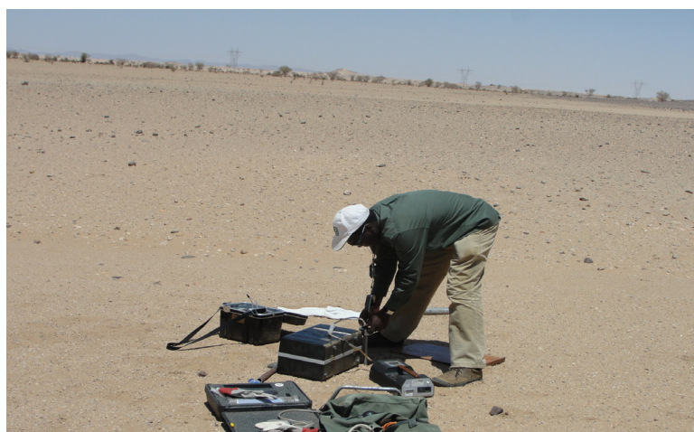
FIGURE 4: Set up for Mercury vapour analyser

The concentration of mercury in the vapour in soil gas can be determined by connecting the flexi tubing to a Jerome (Model 431-X) Mercury vapour analyser which uses a gold film sensor. It uses a pump which pumps the air through a scrubber and into the flow system. The sensor absorbs the Mercury vapour. The instrument determines the amount absorbed and displays the measured concentration on the digital meter in milligrams per cubic meter (mg/m 3 ) of mercury (Jerome 431-X manual, 2000). Figure 4 shows the Mercury vapour analyser as set up in the field.