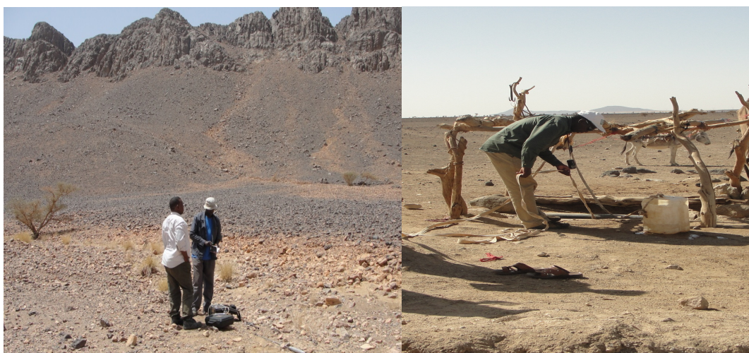
FIGURE 7: Sampling of hand dug water well