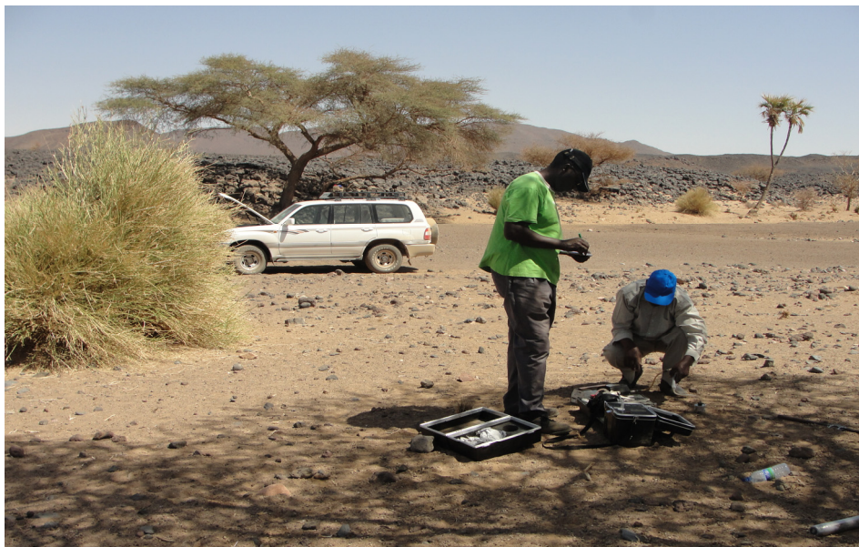
FIGURE 2: RAD7 set up for determination of radon in soil gas

Three background counts were recorded at three -minute intervals prior to introduction of the soil gas sample into the RAD7 radon monitor. After introducing the sample, three readings were taken at three minute intervals to give the total radon counts. After moving to a new location the instrument is purged to remove the radon and thoron count rate that normally build up on the RAD7's solid state