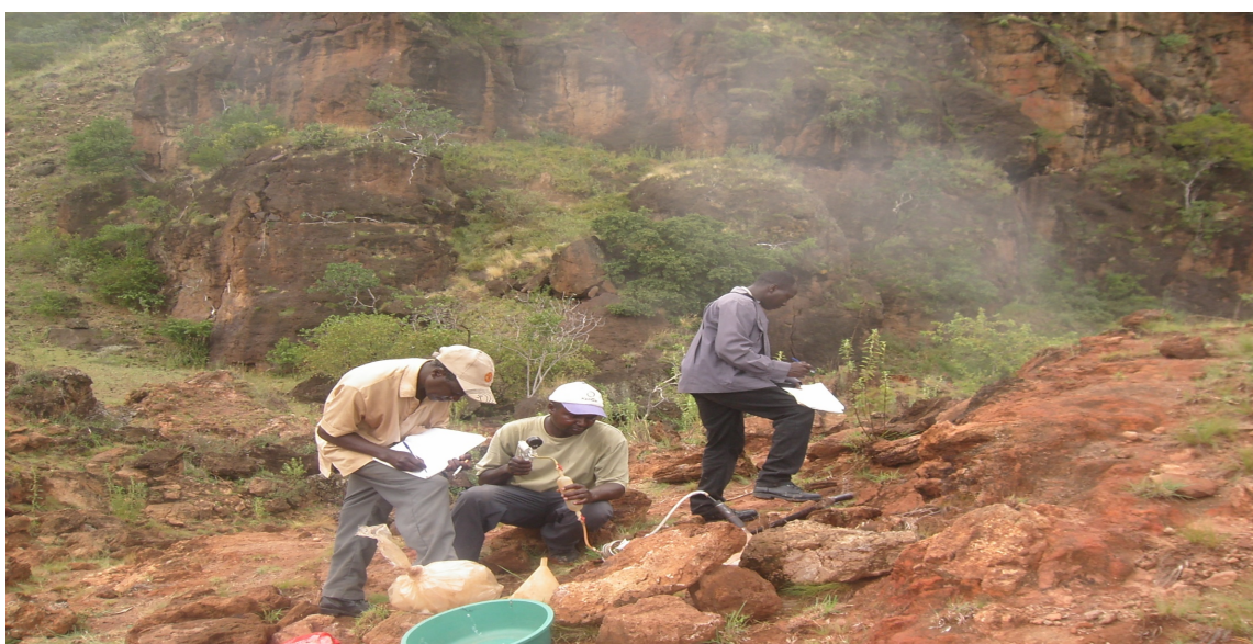
FIGURE 8: Set up for sampling of condensate and gas in steam from fumaroles and hot ground (Sampling in the Crater in Paka)

The fumarole gases are sampled by directing the steam into two evacuated gas sampling flasks containing 50 ml of 40% sodium hydroxide solution and with continuous cooling using cold water being poured on the flask. Carbon dioxide and hydrogen sulphide gases are absorbed by the sodium hydroxide solution and hence create space for the residual gases such as, hydrogen, nitrogen, methane, argon etc. One flask is used for the analysis of carbon dioxide and hydrogen sulphide, while the other flask is used for the analysis of hydrogen, nitrogen and methane using a gas chromatograph.