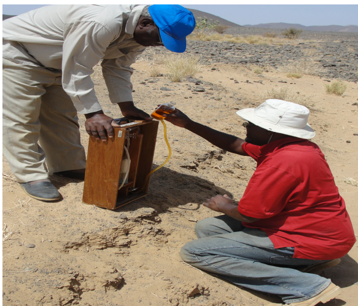
FIGURE 3: Set up of the Orsat apparatus for carbon dioxide determination

After the radon sampling the flexible tube is connected to the Orsat apparatus, for the determination of carbon dioxide (% CO 2 ) in the soil gas. Using suitable pumps, the pathways are purged and the samples of soil gas transferred into the burette of an Orsat analysis apparatus for the determination of carbon dioxide. A stopper and hose pipe are fixed onto the mouth of the jacket and using a hand operated pump, the soil air is driven into the analytical apparatus. A known volume of soil gas is pumped into the burette and subsequently transferred to the absorption vessels which measure about 100 mls. The vessel contains 40% potassium hydroxide (KOH) solution for the selective removal of CO 2 which is determined by the changes in volume in the gas burette, which correspond to changes in volumes given as % total gas. The set up for CO 2 determination using the Orsat apparatus is shown in Figure 3.