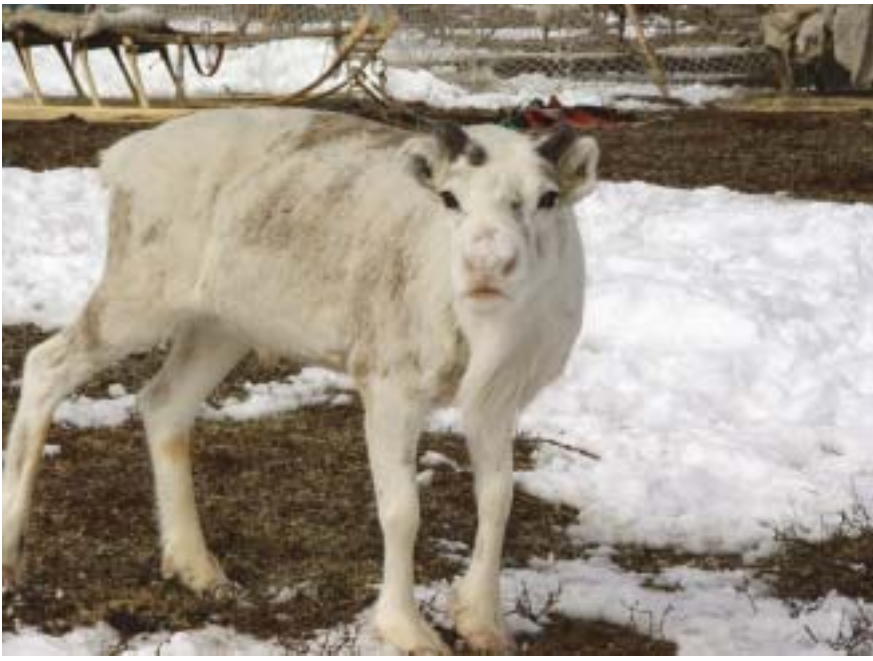
Nenets Autonomus Okrug, Russia.

The following is a minimum list of indicators that will be tracked by the CARMA Network.