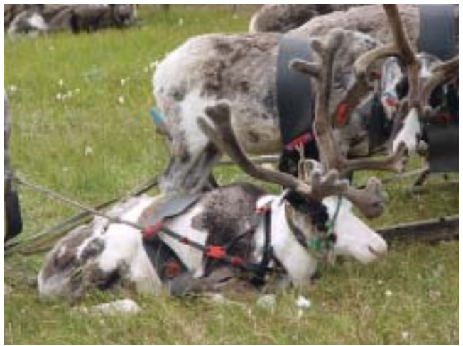
lenets Autonomus Okrug, Russia.

A number of indicators commonly monitored across herds will be tracked. The frequency of monitoring and the specific set of indicators actually monitored vary from herd to herd. A common set could include: