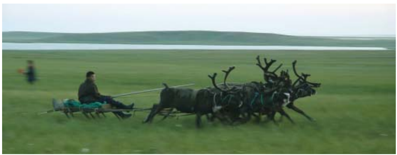
Nenets Autonomus Okrug, Russia.

The network will access existing information from a number of sources and integrate them where feasible. Local knowledge, field-based biological monitoring, and remote sensing are all considered critical elements in the CARMA Network, and provide an important means for