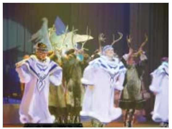
II Congress of Reindeer Herders of Russia, Salekhard, Yamalo-Netes Autonomus Okrug, Russia.