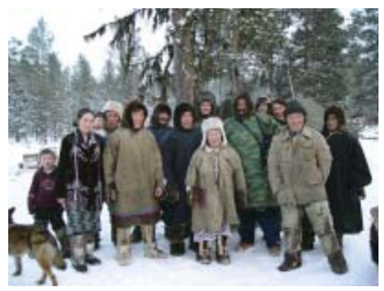
nets reindeer herders from Kanin Peninsula in the forest of the Mesen Region in the "Kanin"community, Kuloy River Onset, Mezen Region, Archangelsk Oblast.

Figure 1 illustrates the circumpolar distribution of Rangifer species.