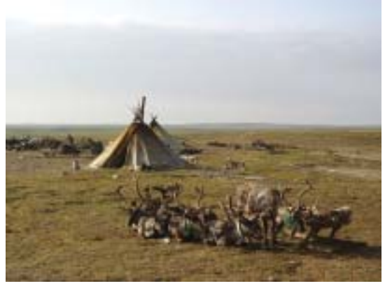
Nenets Autonomus Okrug, Russia.