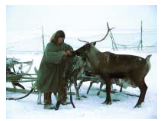
Nenets Autonomus Okrug, Russia.