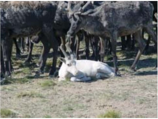
Nenets Autonomus Okrug, Russia.

NOTE: The following network mission, principles, etc. should be considered a draft. This report is being written one week before the workshop to officially launch the CARMA network. The organization and scope of the network will be finalized at that workshop.