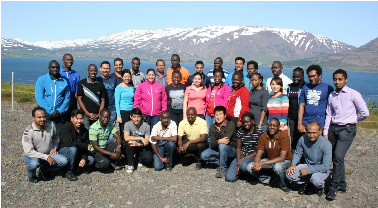
FIGURE 1: The group of UNU Fellows that attended the 6 months training in Iceland in 2013, at Hjalteyri low-temperature field, Eyjafjörður, N-Iceland

For more information on UNU-GTP, see e.g. Fridleifsson (2008, 2010) and Georgsson, (2010, 2012) or its web page ( www.unugtp.is ).