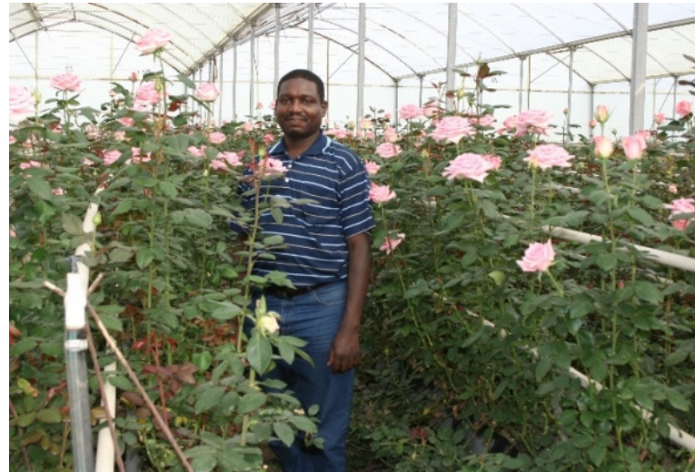
FIGURE 4: Roses grown in a greenhouse heated with geothermal at the Oserian farm, Kenya

In Ethiopia, the Aluto-Langano pilot power plant, built in 1998 for producing 7.2 MWe on-line, has been only in partial operation since few months after its opening about 10 years ago, with mechanical problems in the plant and limited steam supply being difficult problems to overcome. This led to no or low production for long periods of time. After restoration, the plant is now producing 3 MWe (Teklemariam, 2008).