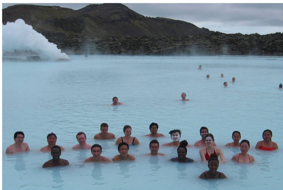
FIGURE 7: UNU Fellows bathing in the Blue Lagoon in 2003

To this can be added benefits such as snow-melting of pavements around houses, not forgetting the use of geothermal water for heating of greenhouses and for fish farming.