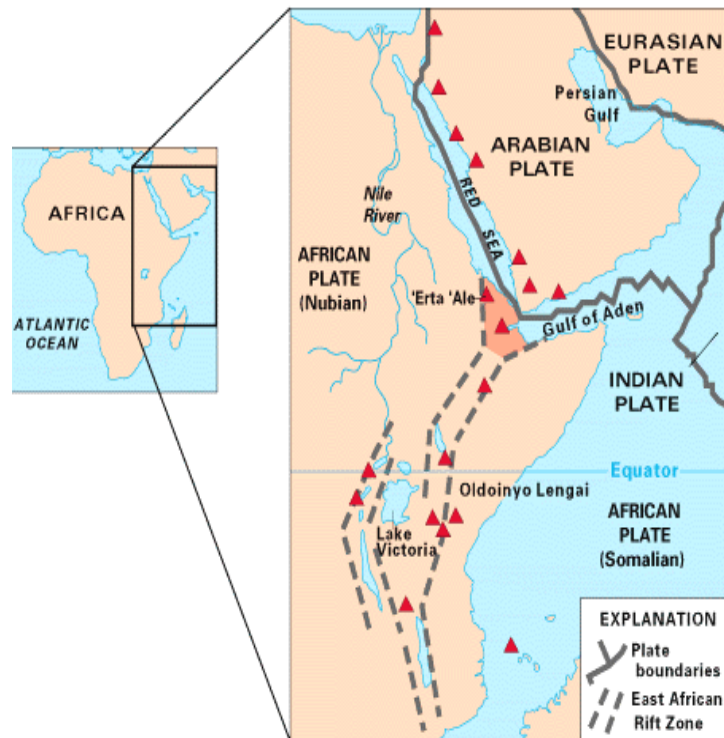
FIGURE 2: The Great East African Rift System (Teklemariam, 2008)

With the technology of today, East Africa has the potential to generate energy in the range 2,500-6,500 MWe from geothermal power (assessment by GEA, 1999). Despite that, Kenya is now the only country harnessing this resource to a significant extent. It has the richest potential, with geothermal potential recently having been evaluated to be able to supply more than 7000 MWe (Simiyu, 2010). Since the early 1980s, Kenya has slowly been increasing its total geothermal power generation from 15 MWe to 210 MWe at the Olkaria geothermal area in 2012 (Figure 3), with big increases scheduled in the near future. With Kenya's Vision 2030, geothermal is scheduled to become Kenya's main source of electricity, with plans for 5000 MWe on-line in the two next decades (Ngugi, 2012). It should also be mentioned that at Lake Naivasha, Kenya, geothermal water and carbon dioxide from geothermal fluids are used in an extensive complex of greenhouses for growing roses (Figure 4). Using geothermal heating to improve the quality of the products started in 2003. The Oserian farm is now (2010) the biggest geothermal greenhouse farm in the world, with 50 ha. of greenhouses being heated with geothermal to produce high quality cut flowers. Rose exports from this "geothermal" farm alone have totalled USD 300 million per year (Mwangi, 2005).