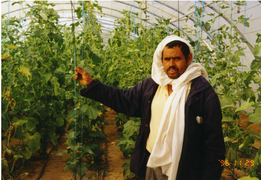
FIGURE 5: A geothermal green house in Tunisia, the hot water flows through plastic pipes at the ground surface

thousands of years. Direct use of geothermal energy is also recorded for Algeria, and Morocco has been exploring for geothermal resources, but Tunisia provides the example for the other countries of North Africa to follow (Ben Mohamed, 2010).