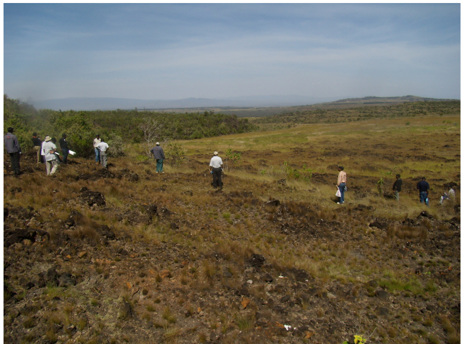
FIGURE 1: A team of earth scientists making site visits to a potential geothermal prospect

Proper application of geophysical measurements can significantly reduce the number of wells needed to characterize a prospect while improving the confidence of interpretations based on direct borehole measurements. Geophysical techniques become increasingly cost-effective as the area and depth to be investigated increase. One limitation, however; certain routine geophysical methods sometimes cannot be used due to cultural noise (electrical power lines or transformers, heavy vehicular traffic, buried pipes, pavement) or natural conditions. The experienced geophysicist knows how to recognize and minimize any influence due to such noise. Site visits (see Figure 1) preferably by a combined team of earth scientists and engineers are often required prior to finalizing plans for a geophysical prospecting project.