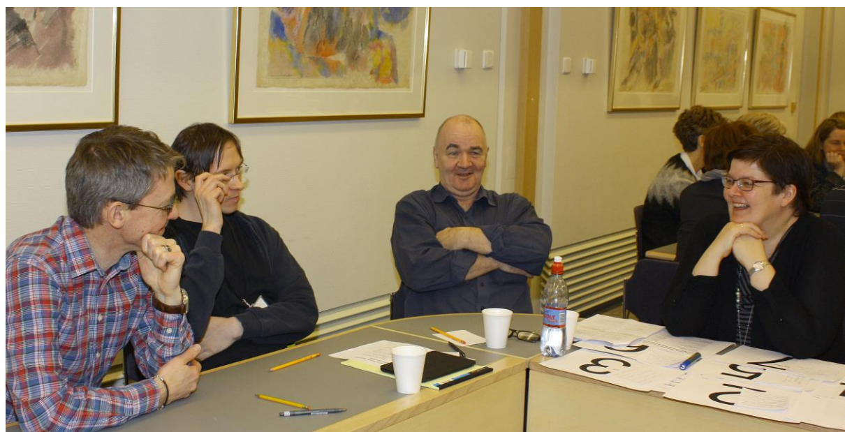
Staff forming the new policy 29 th of January 2013.