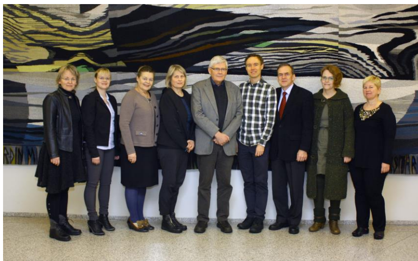
The Library Board 2013.