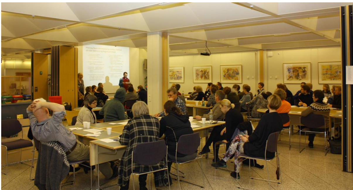
Staff forming the new policy 29 th of January 2013.

National and University Library of Iceland: ANNUAL REPORT 2013.