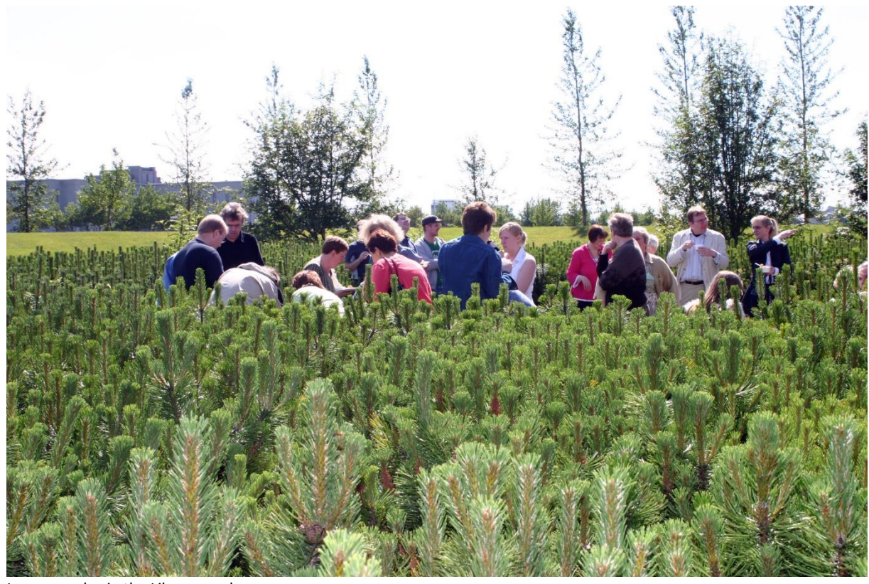
Ice cream day in the Library garden.