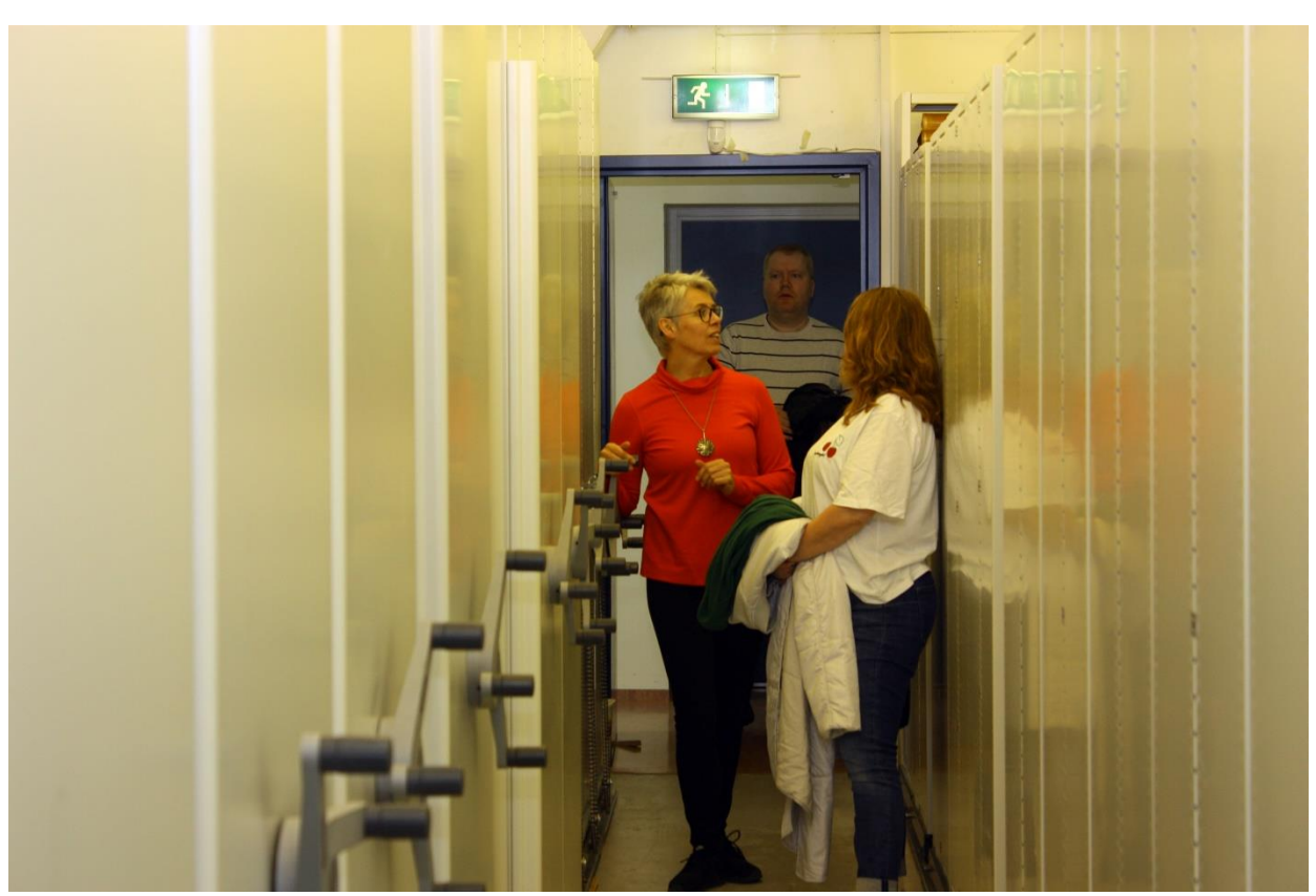
Stacks in the Reserve Library in Reykholt.