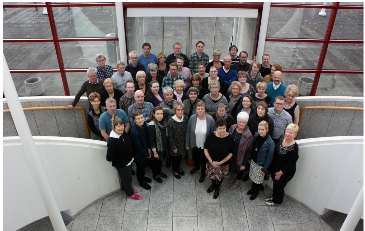
Part of the staff November 14<sup>th</sup> 2015.