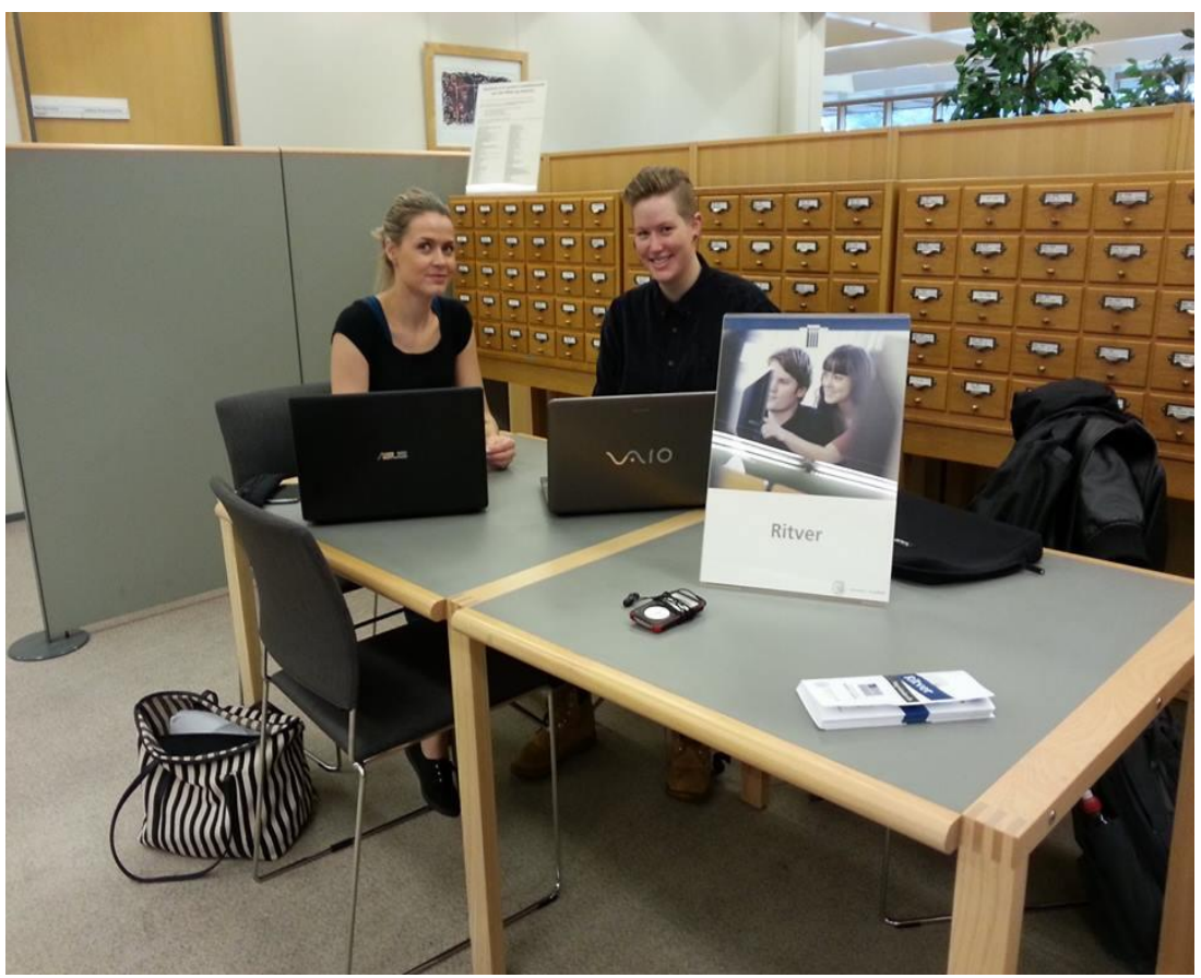
Students using the services of the Writing Center.