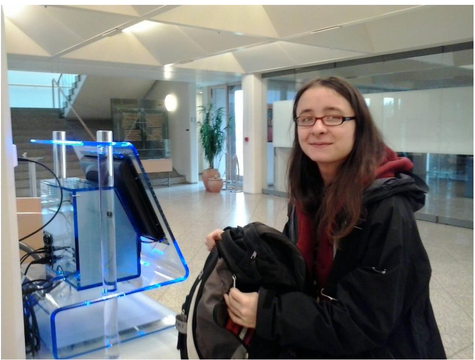
The first patron to use the new selfcheck unit for circulation.