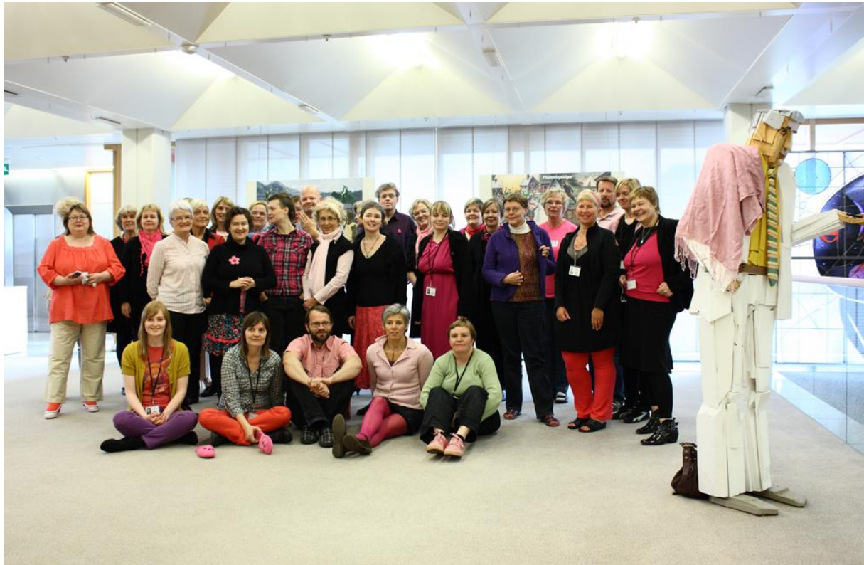
„Pink Friday“ October 8 th 2010.

National and University Library of Iceland: ANNUAL REPORT 2010.