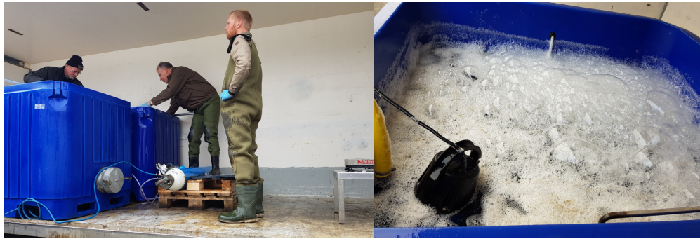
Figure 1. Tubs and the system used to transport Arctic char from Grindavík to Matís

For Trial one approximately 130 kg of fish were delivered to MARS (Keldnaholt, Reykjavík) on the 16 th of September 2019; thereof about 120 kg used for the trial (approx. 59 kg in Tank 1 and 61.8 kg in Tank 2). For trial two about 255 kg of Arctic char were delivered to MARS on the 26 th of September and thereof approximately 230 kg were used for the trials (about 119 kg for Tank 1 and 112 kg for Tank 2). It should be noted that the two holding tanks were connected so they served as a duplicate. To transfer the fish into the 2 x 1 m 3 tanks, first the sea water from the transport tubs was pumped into the tanks. The fish was then transferred in batches, using a large fishing net into 10 litre boxes with the seawater, weighed and then transferred into the tanks.