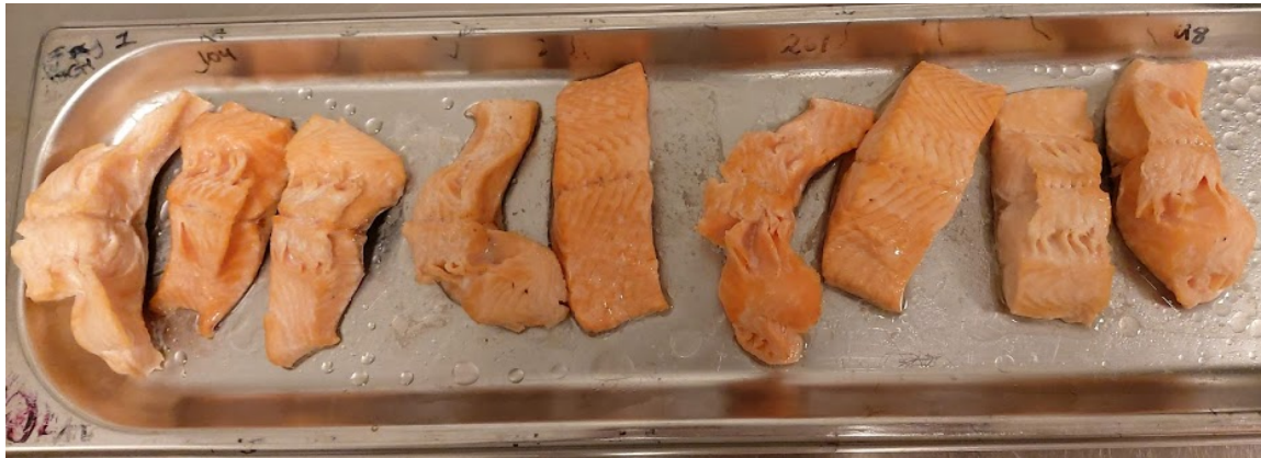
Figure 4. Arctic char samples from end of Trial 2, after cooking for 8 minutes and cooling for 30 minutes at room temperature (cooking yield). Counting from left to right, very deformed samples are: nr. 1, 4 and 6. Slightly deformed samples are: nr. 2, 3, 8 and 9. Samples nr. 5 and 7 are normal in appearance.

Group Initial fish had less cooking yield than slaughtered fish at end of both Trial groups. Cooking yield for group Initial fish was on average 88% but 91% for end of both Trial groups. ( p = 0,014 ). After cooking, the appearance of some samples was unusual, deformed and shrunken (Figure 4).