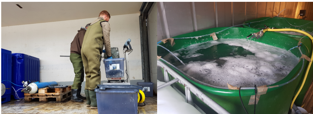
Figure 2. Arctic char transferred to the RAS tanks used for the trials

For Trial one approximately 130 kg of fish were delivered to MARS (Keldnaholt, Reykjavík) on the 16 th of September 2019; thereof about 120 kg used for the trial (approx. 59 kg in Tank 1 and 61.8 kg in Tank 2). For trial two about 255 kg of Arctic char were delivered to MARS on the 26 th of September and thereof approximately 230 kg were used for the trials (about 119 kg for Tank 1 and 112 kg for Tank 2). It should be noted that the two holding tanks were connected so they served as a duplicate. To transfer the fish into the 2 x 1 m 3 tanks, first the sea water from the transport tubs was pumped into the tanks. The fish was then transferred in batches, using a large fishing net into 10 litre boxes with the seawater, weighed and then transferred into the tanks.