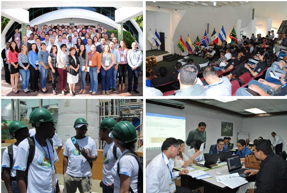
FIGURE 7: SDG Short Course I in El Salvador. Clockwise from top left: Group photo, lecture, project work, field trip to Berlin geothermal power plant.