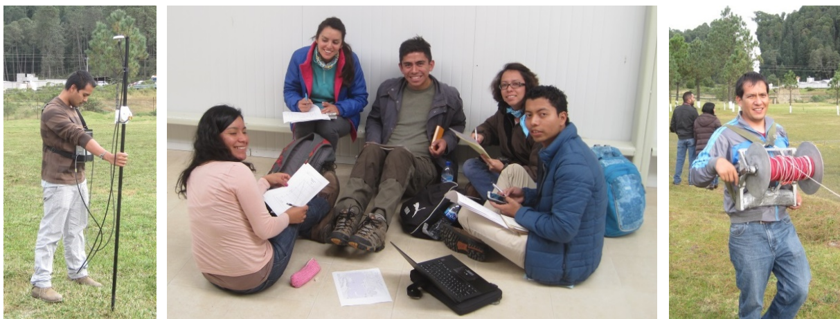
FIGURE 8: Participants of Short Course on Geothermal Exploration carrying out exercises in Los Azufres