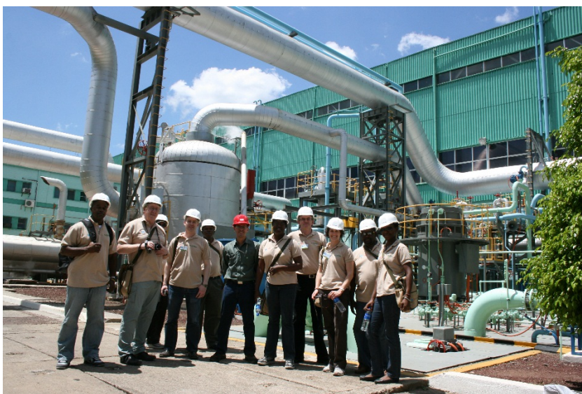
FIGURE 1: Some lecturers and participants in the Short Course IV in 2012 visiting the Ahuachapán geothermal power plant in El Salvador

Central America is one of the world's richest regions in geothermal resources. Geothermal power stations provide 12% of the total electricity generation of the four countries Costa Rica, El Salvador, Guatemala and Nicaragua, according to data provided from the countries (CEPAL, 2017; see also Table 5). In each of the 4 countries there are geothermal power plants in operation in two geothermal areas. The photo in Figure 1 is taken at the Ahuachapán geothermal power plant in El Salvador, while Figure 2 shows the recent Las Pailas binary power plant in Costa Rica. The electricity generated in the geothermal areas is mainly replacing electricity generated by imported oil. The geothermal potential for electricity generation in Central America has been estimated some 4 GWe (Lippmann 2002), but less than 0.7 GWe have been harnessed so far. Exploration and production drilling has been ongoing in several new fields in the region with positive results, most recently in the San Vicente field in El Salvador.