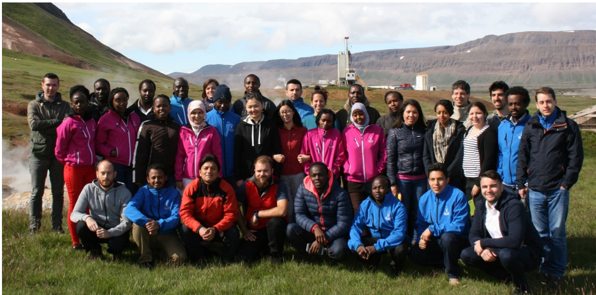
FIGURE 4: UNU Fellows in Iceland for the 6-month training in 2016

In the first decade of the 2000s or so, regular funding of the UNU-GTP allowed financing of six months training of 18-20 UNU Fellows per year, with 0-2 extra fellowships financed annually through other sources, at least partially. However, the last six years have seen a dramatic increase in the latter. Improved set-up and new facilities of the UNU-GTP in Iceland have made it possible for UNU-GTP to accept additional Fellows if financed through external sources. This is reflected in the large groups seen in 2010-2016, with the largest groups to date trained in 2013, including 34 UNU Fellows, 13 of whom were mainly financed through other agencies, and again in 2016, 15 of whom were mainly financed through different funding mechanisms. Especially Kenya has utilized this opportunity extensively. Figure 5 shows the development of the training capacity of the UNU Geothermal Training Programme in Iceland from the beginning in 1979 to 2016. It should be noted that in Figure 5, the numbers for 2013 include 5 additional Kenyan borehole geologists, who got a similar training through a 3-month course