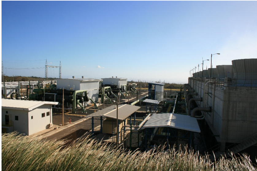
FIGURE 2: The Las Pailas binary geothermal power plant in Costa Rica

volcanoes. High-temperature geothermal resources in Bolivia, Chile, Colombia, Ecuador and Peru are mainly associated with the volcanically active regions, although low-temperature resources are also found outside them. Despite this, geothermal has been slow to take off. Until recently, the only geothermal power plant that had been operated on the continent was the 0.7 MWe binary demonstration unit in the Copahue field in Argentina, which was decommissioned in 1996. However, the 48 MWe Cerro Pabellon power plant has now been inaugurated in Chile (September 2017), setting an important example of geothermal utilization in the continent.