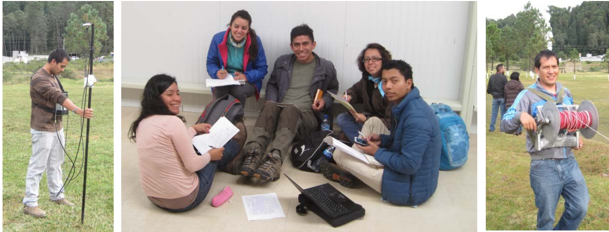
FIGURE 8: Participants of Short Course on Geothermal Exploration carrying out exercises in Los Azufres

In 2014, UNU-GTP cooperated with the Mexican Centre for Innovation in Geothermal Energy (Centro Mexicano de Innovación en Energía Geotérmica – CeMIEGeo) in conducting a short course in Mexico. Short Course on Geothermal Exploration was held in Los Azufres during 24-29 November of that year. The course was attended by 42 participants from different geothermal companies, institutions and universities in Mexico (Figure 8). Lecturing was mostly carried out by Icelandic experts from ÍSOR – Iceland GeoSurvey.