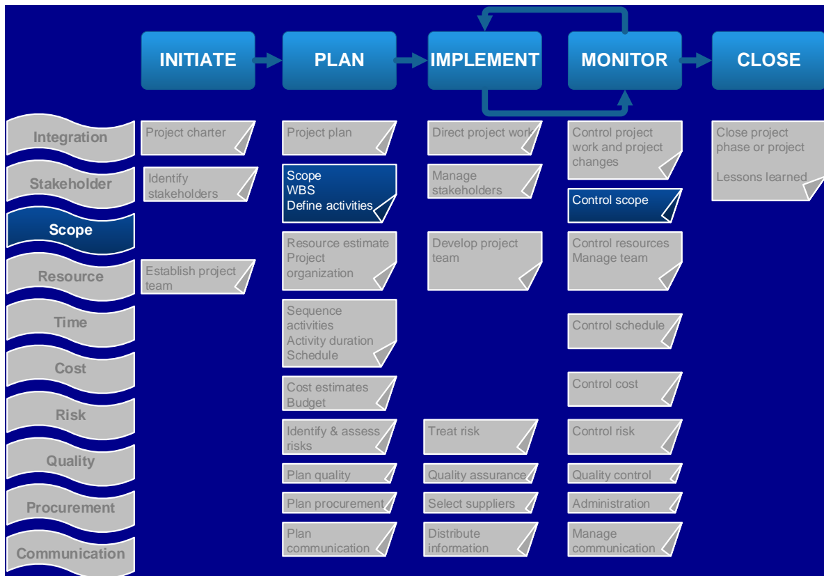
FIGURE 1: The project cycle and the ten knowledge areas (PMI, 2013)