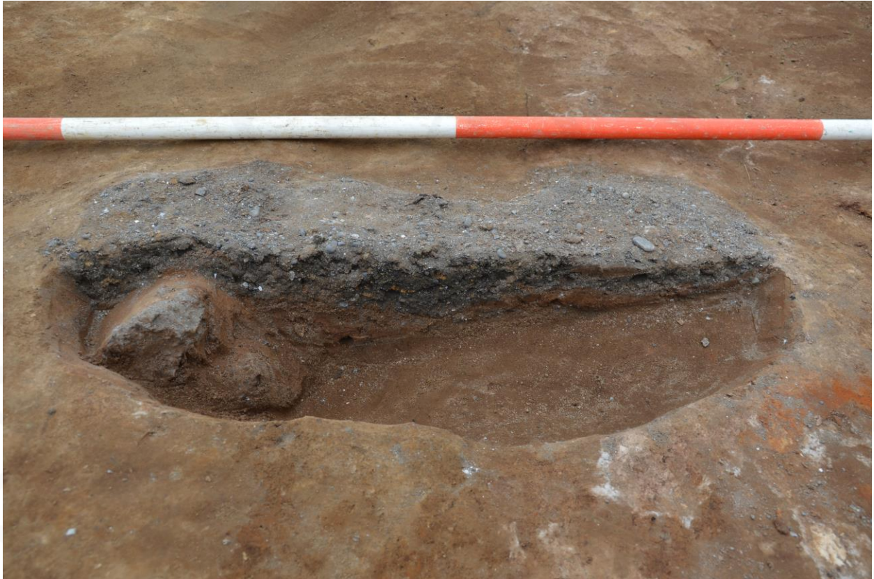
Figure 10. Hearth [5360]. Facing east.

Cut [5360] truncated an earlier feature, external hearth [5363], a sub-rectangular cut with rounded corners, vertical sides and a flat base (see Figure 11). The cut measured 28 x 110 cm, 30 cm deep, and was orientated east – west. The cut contained two separate fills, the topmost, [5361], a mix of sand and silt with charcoal burnt bone and fire-cracked rocks. The lower, [5362], a wood ash deposit with charcoal and sea-shell inclusions. This lower hearth could be dated through tephrochronology to 940 – 1410.