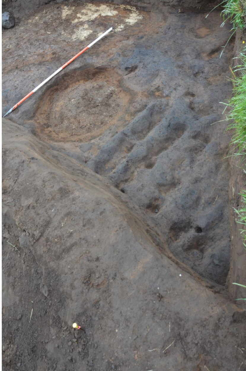
Figure 12. Ard-marks [5452] post-excavation. Boundary [5467] lies across the bottom half of the photo. Facing south.