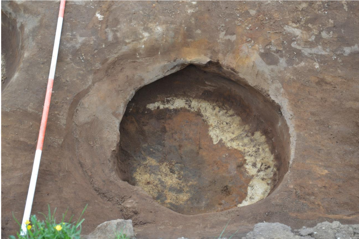
Figure 9. Cooking pit [5399]. Fill [5398] still in situ, truncated by pit [5372]. Facing north.

Two intercutting external hearths were also excavated in the area south of the cemetery boundary. The later of these could be dated through tephrochronology to 1300-1410. This was a sub-rectangular cut 45x80 cm, 20 cm deep, [5360], orientated north-south, with rounded corners, vertical sides and a flat base (see Figure 10). It contained three separate fills. The topmost was a sandy gravel with some animal bone, shell and fire-cracked rocks, [5357]. This sealed a deposit of silty sand containing some animal bone, [5358]. The base fill consisted of mixed silts with slight bone and fire-cracked stone inclusions, [5359].