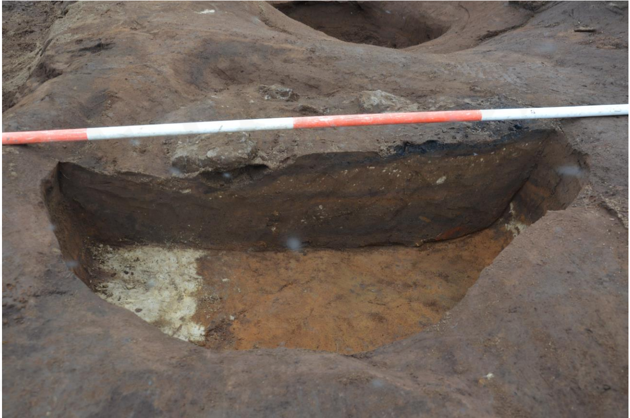
Figure 7. Cooking pit [5387]. Facing east.

Two intercutting cooking pits were excavated in the area. The later of these was a cooking pit, [5372], which could be dated through tephrochronology to 1300-1477 (see Figure 8). This was a sub-circular pit with a concave cross section, 1.05 m in diameter and 95 cm deep. It contained three fills, the topmost [5369], was a mixed turfy deposit, which in turn