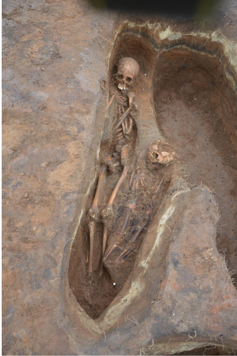
Figure 3. Skeletons HSM-A-154 (left) and HSM-A-157 (right). Truncated by [5412]. Facing west.