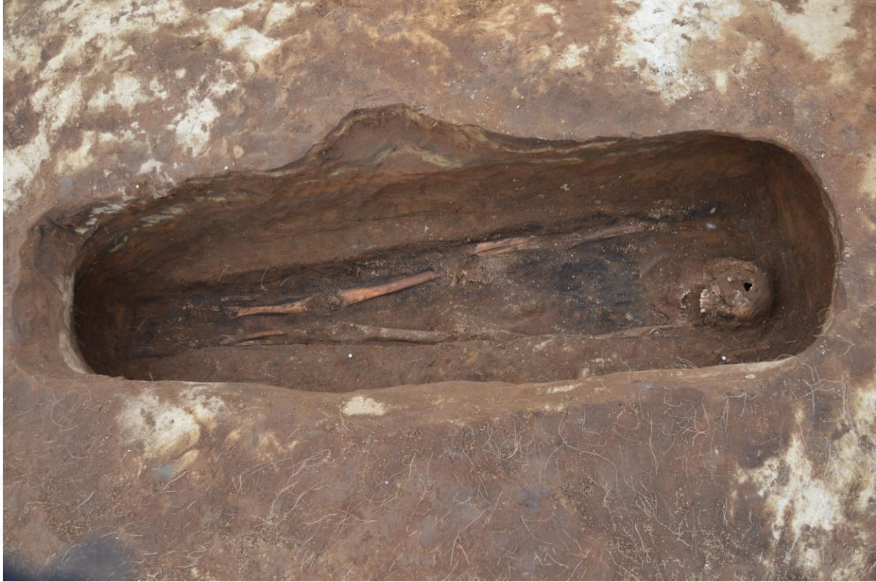
Figure 2. Skeleton HSM-A-141. Facing south.