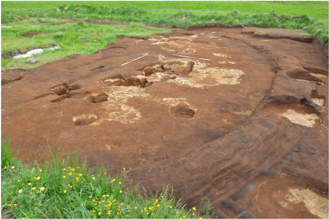
Figure 14. Boundary wall [5467] at the end of excavation. Facing north-east.

and church. The construction of the boundary can be dated through tephrochronology to 940-1104 (see Figure 14).