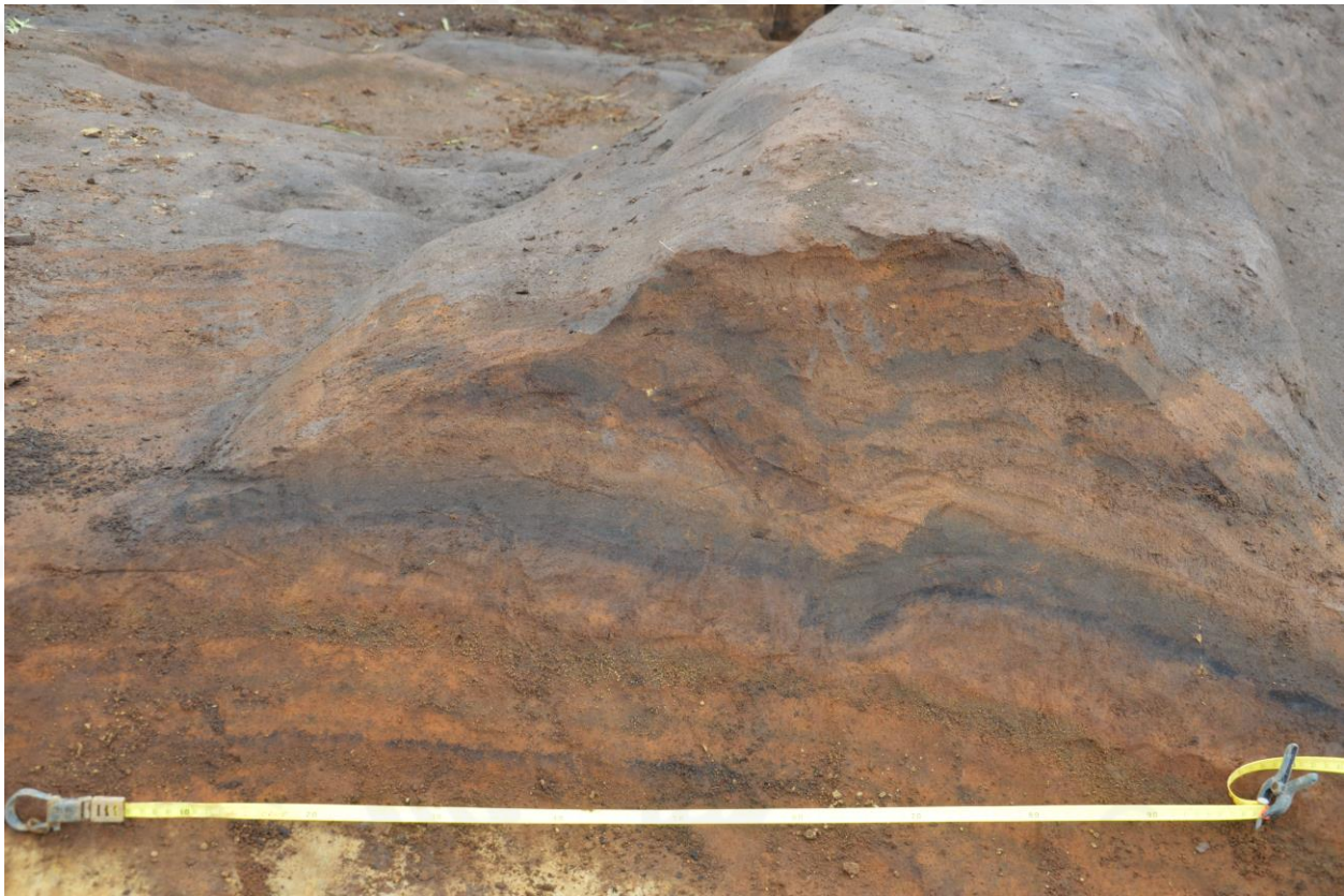
Figure 13. Cross section through boundary wall [5467]. Facing west.

strengur turves containing the V940 tephra, which had been cut from outside the boundary [5416] ≠ [5464]. Within the excavation the wall is quite even, 1 m thick at the base, and 50-60 cm at the top. The wall was highest in the western end of the excavation area (35 cm), and lowest at the eastern end (15cm), see Figure 13. It had however been truncated in several places. A large irregular cut, [5274], excavated in the eastern part of the excavation area in 2014 (Hildur Gestsdóttir 2015) truncated a 3.7 m long stretch of the boundary. Similarly cooking pit [5286], also excavated in 2014 (Hildur Gestsdóttir 2015) also truncated a 1.5 m stretch of the southern edge of the boundary. Two of the cooking pits excavated during the 2015 season, [5387] and [5399], are also partially cut into the southern edge of the cemetery boundary.