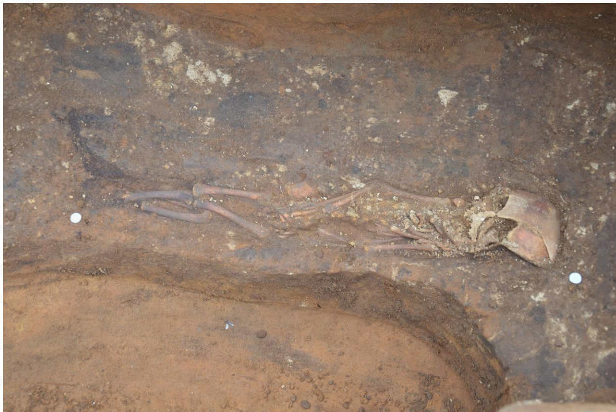
Figure 5. Skeleton HSM-A-140. Truncated by [5354]. Facing south.