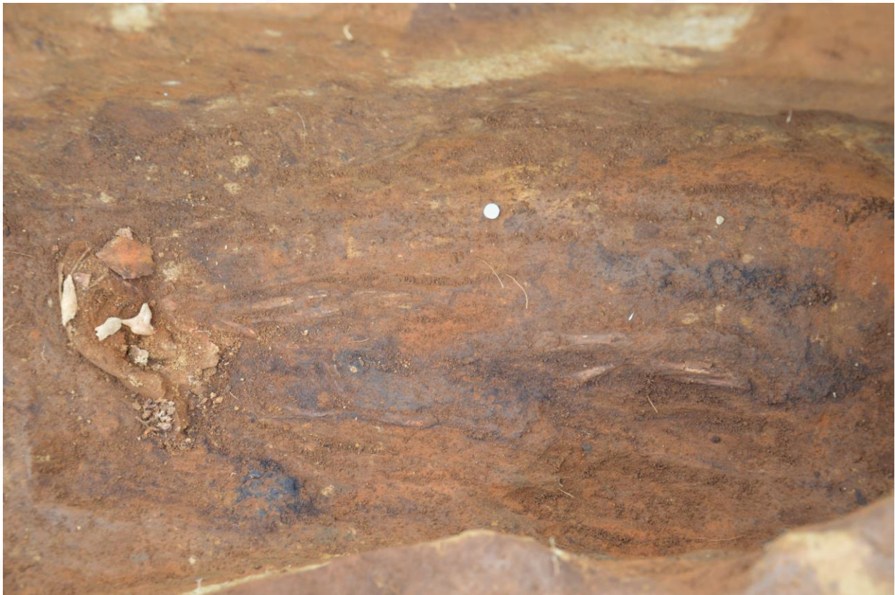
Figure 4. Skeleton HSM-A-139. Facing north.

cemetery, therefore five of the graves had no preserved bone. All the burials in this area contained neonates or very young juveniles. There was one instance of a double inhumation (HSM-A-166 & HSM-A-167) and one instance where a poorly preserved cranium (HSM-A-159) may belong to a truncated skeleton (HSM-A-162) discovered below it within the same grave cut. For further detail see Table 3 and Appendix 4.