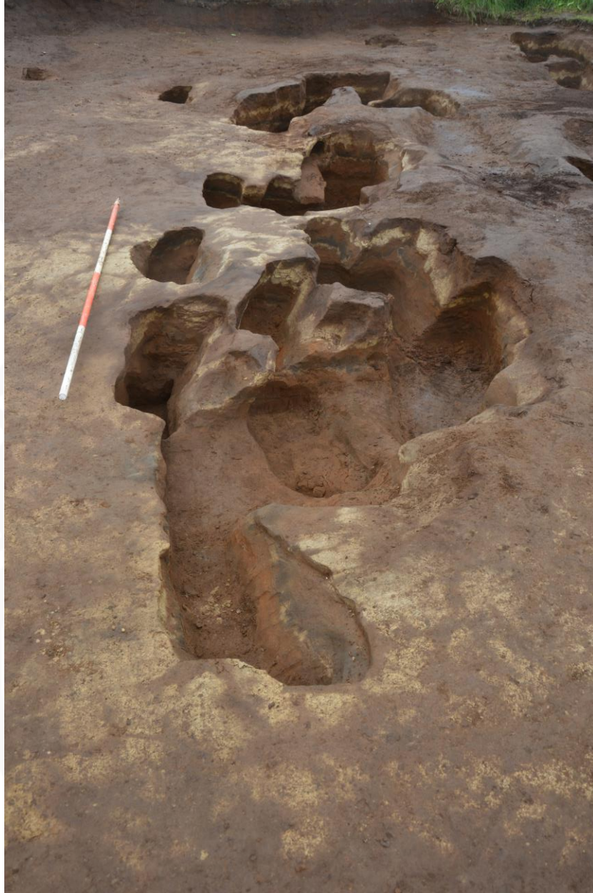
Figure 6. Intercutting burials in central area, after excavation. Facing west.