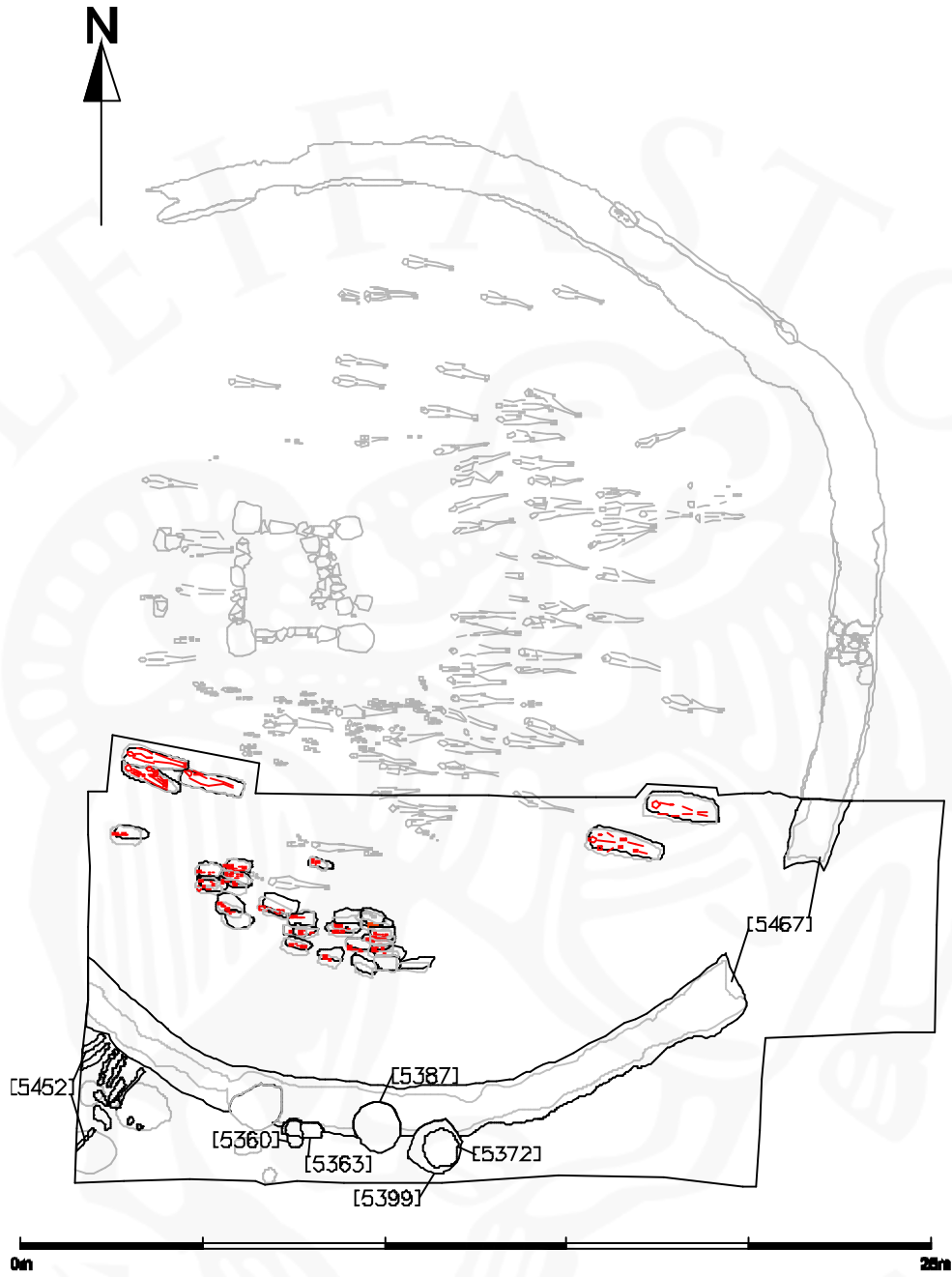
Figure 1. The excavation area and main features. The outlines of graves excavated during the 2015 season are shown, with the skeletons in red. Skeletons and features from previous seasons are shown in grey.