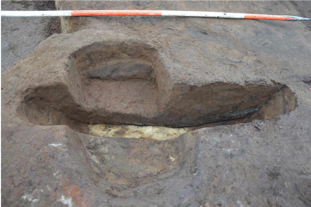
Figure 11. Hearth [5363]. Facing north.

It must be noted that all the cooking pits and hearths excavated both during the 2014 and 2015 season are cut through 30 cm thick anthropogenic deposits which had built up against the outer (southern) edge of the cemetery boundary ([5467], see discussion below). These deposits are made up of turf debris ([5349], [5404], [5045], [5429] & [5441]); upcast, [5433]; peat-ash ([5351] & [5401]); and wood ash deposits ([5348], [5397], [5419], [5420] & [5430]) most likely originating from the farm-mound which lies immediately west of the cemetery. In between these anthropogenic deposits were intermittent aeolian layers ([5347], [5350], [5400], [5425], [5426], [5427], [5428] & [5461]).