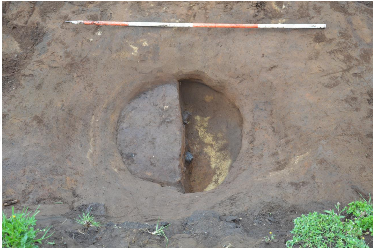
Figure 8. Cooking pit [5372]. Facing north.

sealed [5370], a turfy deposit, which sealed the bottom most deposit, consisting of wood-ash with inclusions of charcoal and burnt stones, [5371].