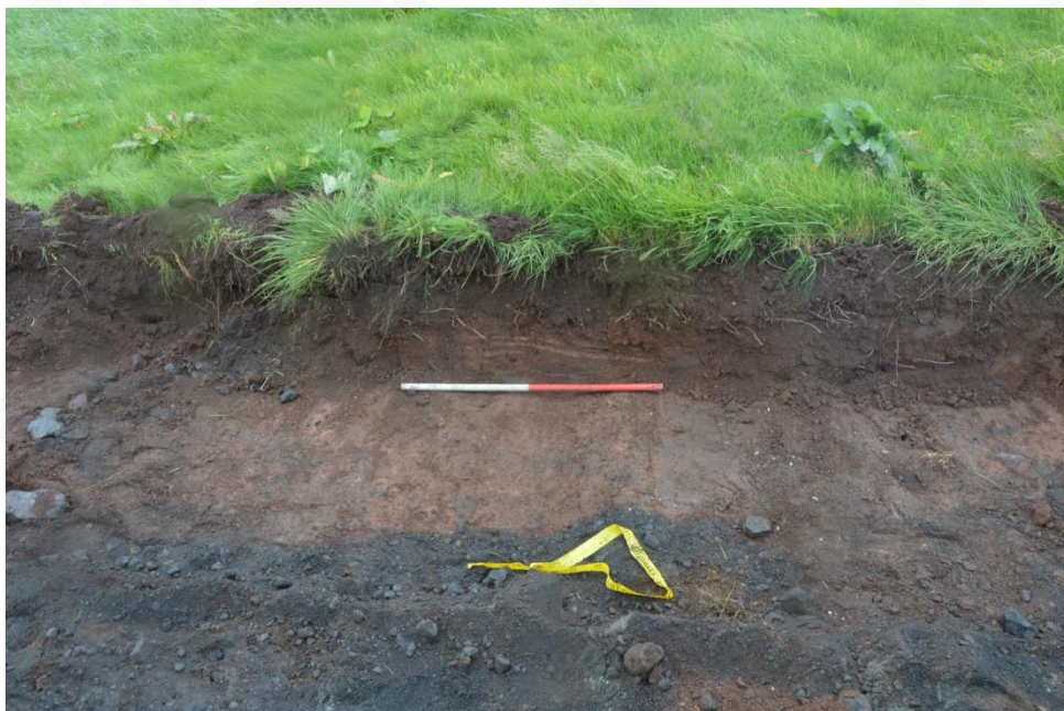
Figure 7. Part of larger peat-ash deposit. Note distinct phases of peat-ash deposition (profile). Facing north-east.

Clearance of the same profile of the excavated area further towards north-west also revealed that there may have been several phases of deposition of the peat-ash material in the past (Figure 7).