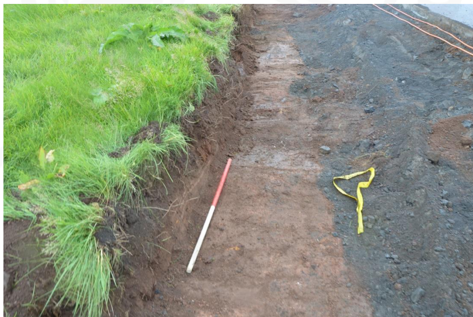
Figure 5. Part of larger peat-ash rich deposit. Facing south-east.