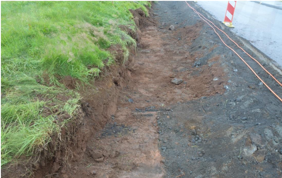
Figure 3. Excavation area. Facing south-east. Note truncation made by earlier development work.