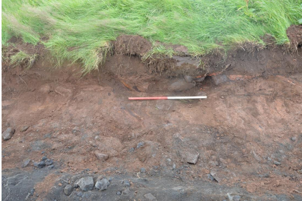
Figure 6. Part of larger peat-ash deposit with higher concentration of turf debris and remains of material collapsed from the neighbouring farm mound. Facing north-east.

Still, somewhat higher concentration of turf-debris patches but also presence of collapsed material originating from a neighbouring farm mound was noted in its central part and in the profile of the excavated area at the side adjacent to farm mound (Figure 6).