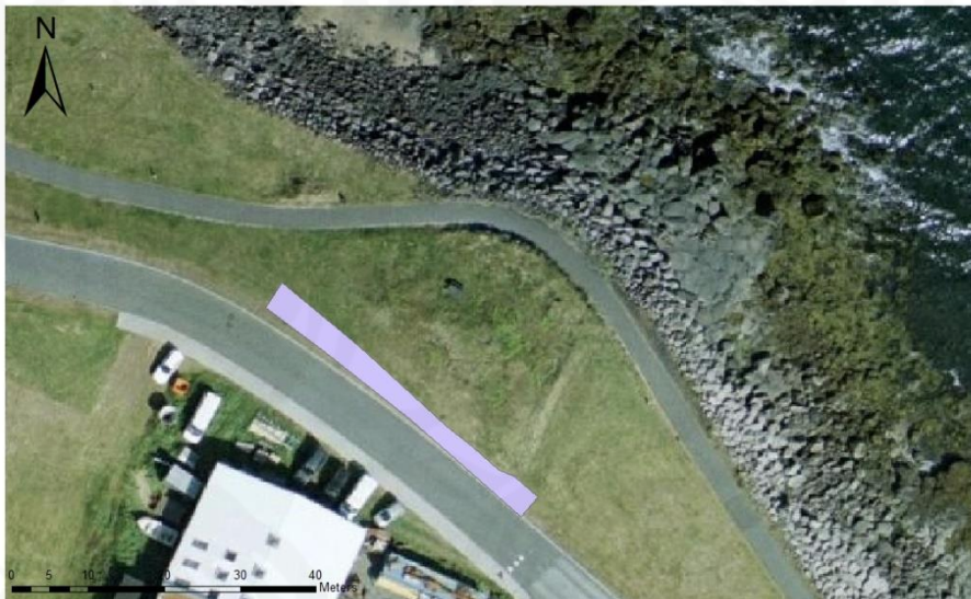
Figure 1. Location and extent of the excavation area (colored pink).

The monitoring was carried out by Nikola Trbojević of Fornleifastofnun Íslands, following an agreement/correspondence with the municipality of Seltjarnarnes and development company Loftorka ehf 1 . The monitoring was authorized by Minjastofnun Íslands 2 . Lísabet Guðmundsdóttir of Fornleifastofnun Íslands recorded the site with total station.