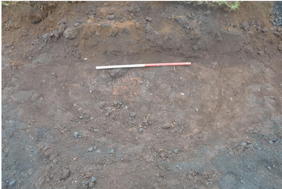
Figure 8. The smaller peat-ash rich deposit. Facing north-east.

At the very south-east end of the excavated area another, minor peat-ash rich deposit was uncovered. Unlike the larger peat ash deposit that occupied the central part of the excavated area, this deposit contained remains of crushed shell and decayed animal/fish bones (Figure 8).