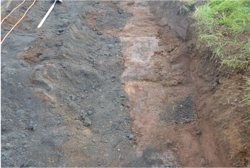
Figure 2. Excavation area. Facing north-west. The gravel to the left on the photo is in a modern truncation and the brown soil to the right is the archaeological deposit.

The extent of the excavated area subjected to monitoring was ca. 133 m 2 (Figure 1) and the area was excavated down to depth of ca. 0.45 m. The excavation revealed that a large proportion of the site was already truncated by an earlier development work when (gravel- and sand-made) foundations for the Norðurströnd street and infrastructural features (i.e. optical fibre-cables) were laid down.