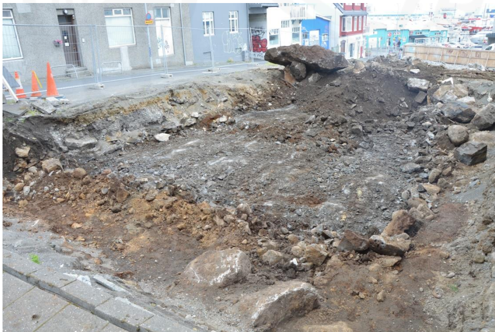
Figure 6. Excavation area after removal of the stone-built feature. Facing north-west.

Further removal of the mentioned concrete-built feature revealed no archaeological features. The machine-excavation uncovered only natural-ground layer and bedrock which excluded the need for any further archaeological monitoring and/or research at the site (Figure 6).