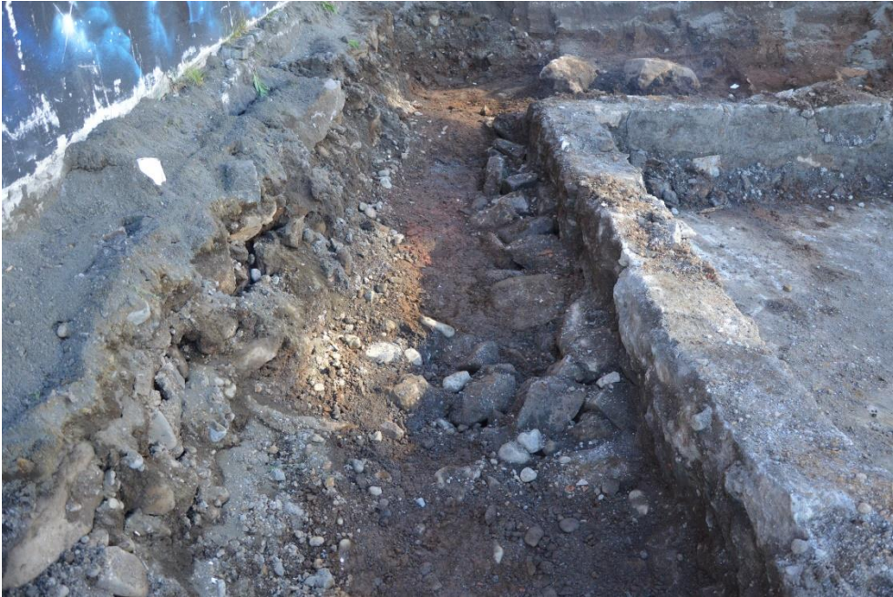
Figure 5. Peat-ash rich deposit in the south-east corner of the area. Facing south.

mentioned concrete-made building. This layer appeared to be the only archaeologically-valuable layer at the site (Figure 5).