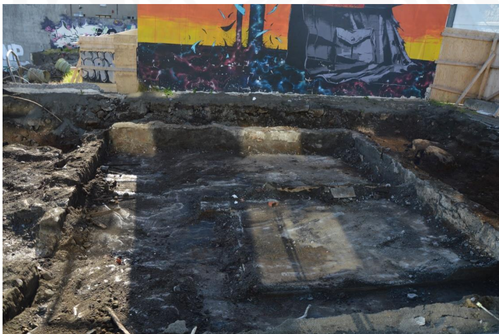
Figure 4. Concrete-built feature. Facing east.

The machine-excavation at this location also revealed remains of peat-ash rich midden deposit, positioned at the approximate depth of 0.8 m in the south-east corner of the area. The deposit, occasionally only few centimetres thick, contained patches of turf-debris, charcoal remains and few finds (yellow brick, animal bones, glass, roof-slate stones and ceramics). The artefacts can be dated to late 19 th / early 20 th century and hence associated with the abovementioned features assumed to have existed at this location. It appears obvious that this midden deposit extended over larger area in the past; unfortunately, it was heavily truncated and disturbed by the foundation of the