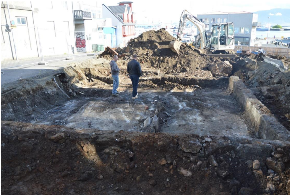
Figure 3. Concrete-built feature. Facing north.