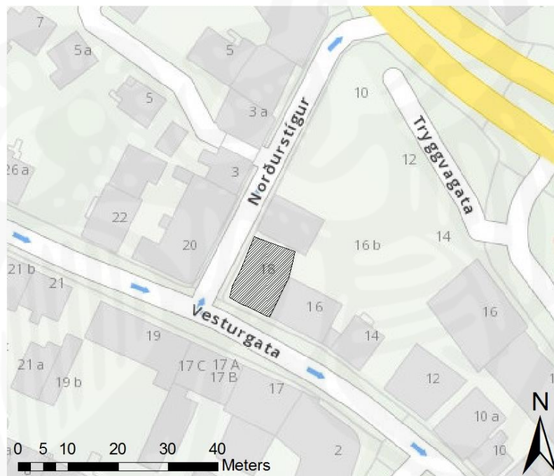
Figure 1. Location and extent of the excavation area.

During the period from August 2 – 8 th 2016, archaeological monitoring of development-related machine-excavation was carried out at Vesturgata 18, 101 Reykjavik, at the location which was until recently used as a parking lot 1 (Figure 1). The aim of the monitoring was to identify and record eventually uncovered archaeological features inside an area of ca. 126m 2 . The monitoring was carried out by Nikola Trbojević of Fornleifastofnun Íslands, following an agreement and close correspondence with development company Mannverk 2 , and it was authorised by the staff of Minjastofnun Íslands 3 . Lísabet Guðmundsdóttir of Fornleifastofnun Íslands recorded the site with total station.